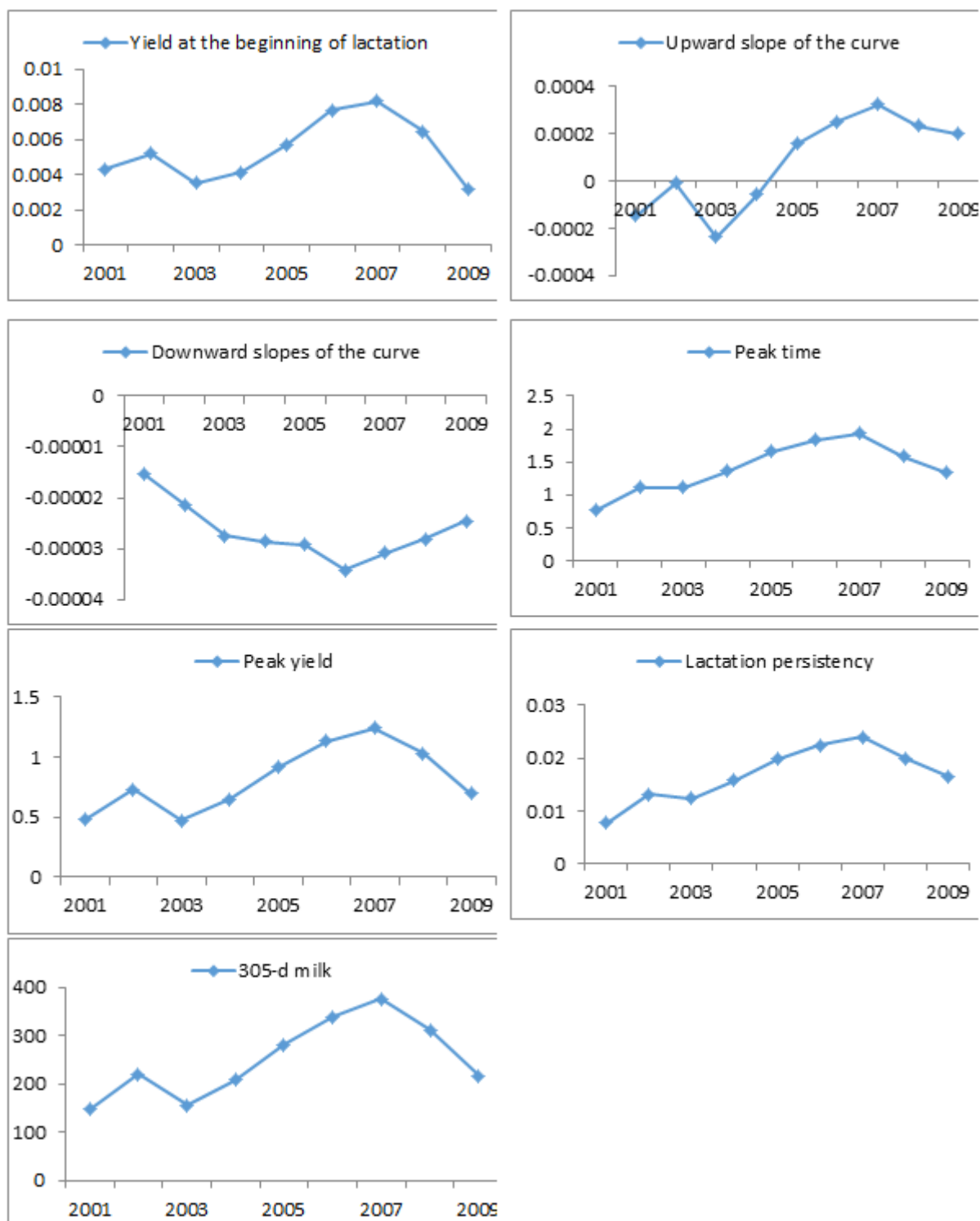
Figure 3 Genetic trends for lactation curve traits (initial yield, upward and downward slopes of the curve, peak time, peak yield, lactation persistency, and 305-d milk) for first parity cows born from 2001 to 2009

In the period from 2001 to 2009, upward slope of the curve, lactation persistency, peak time, peak yield and 305-d milk yield increased and showed significant genetic trend ( P < 0.05 ), but initial yield and downward slope of the curve showed no significant genetic trend ( P \geq 0.05 ).