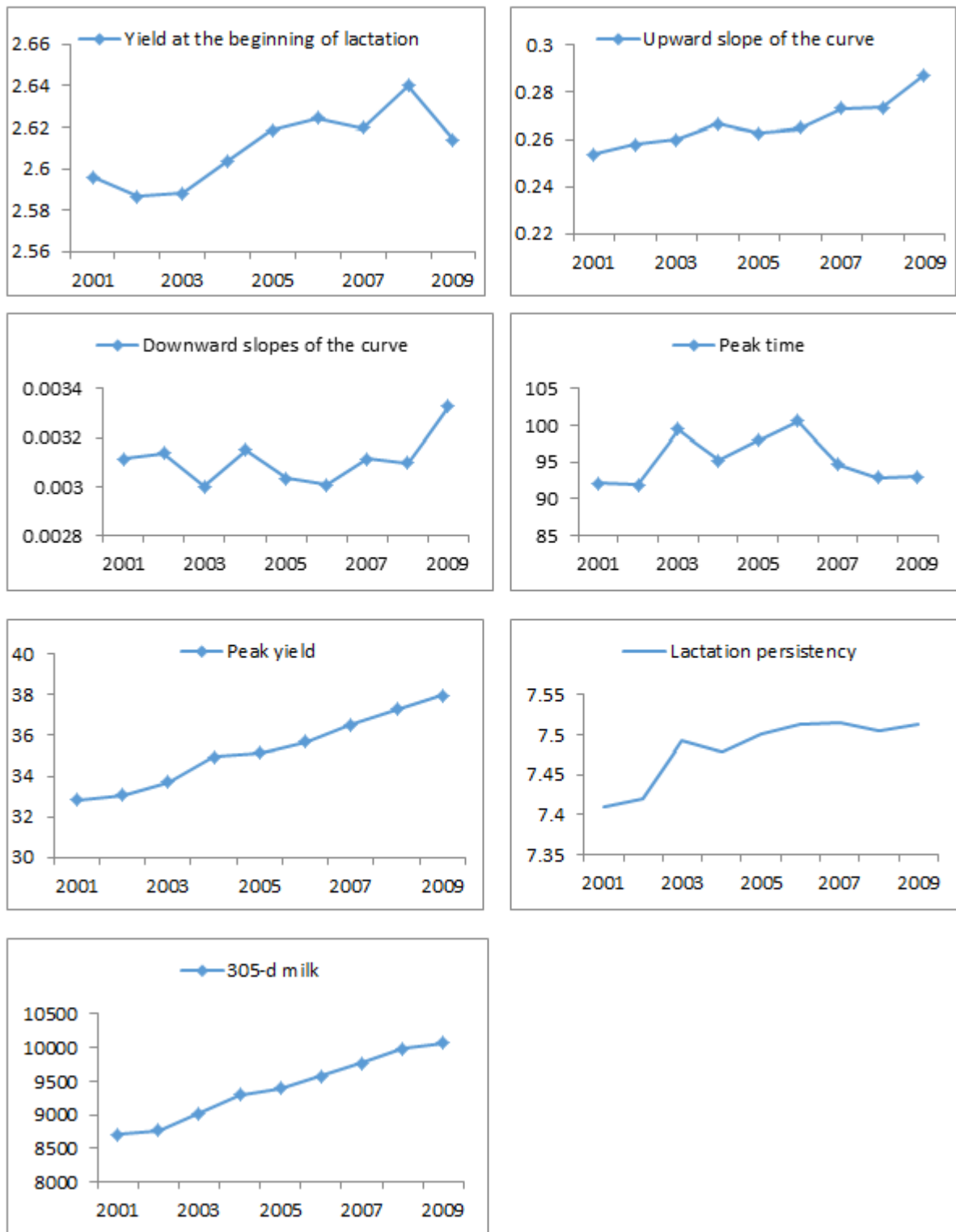
Figure 2 Phenotypic trends for lactation curve traits (initial yield, upward and downward slopes of the curve, peak time, peak yield, lactation persistency, and 305-d milk) for first parity cows born from 2001 to 2009

In the period from 2001 to 2009, initial yield, upward slope of the curve, lactation persistency, peak yield and 305-d milk yield significantly increased ( P < 0.05 ), but downward slope of the curve and peak time did not significantly changed ( P \geq 0.05 ). Phenotypic trends for 305-d milk