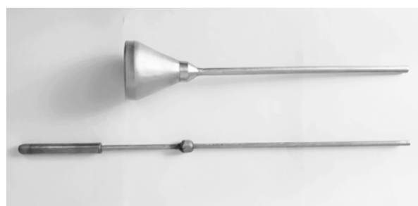
Figure 1 Stainless steel funnel with plungers

Finally, best excreta collection time with considering the maximum amount of excreta was determined.