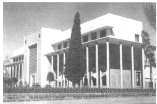
Fig. 2: Iranian National Bank by Mohsen Foroughi, Shiraz