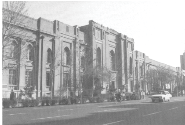
Fig. 4: Central Post office, by Nicholai Markov Tehran, 1934

Only features of pre-Islamic architecture were considered. Columns, Column capitals, stairs and ornamental designs and so on were borrowed from Sassanid and Hakhamanid eras, of course, respecting the necessity of devising new functions there was no need for considering the pre-Islamic pattern of