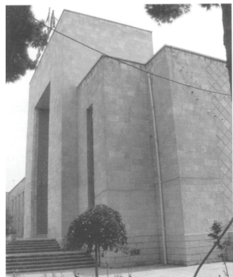
Fig. 8: Isfahan National Bank, by Mohsen Foroughi, 1942