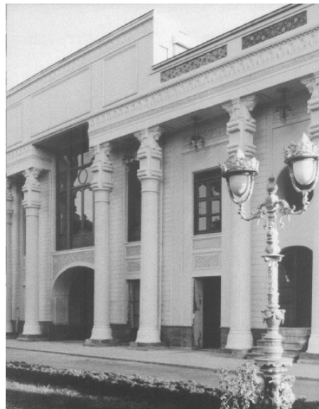
Fig. 6: North side of National consultative Assembly by Karim Taherzadeh Behzad, Tehran, 1936