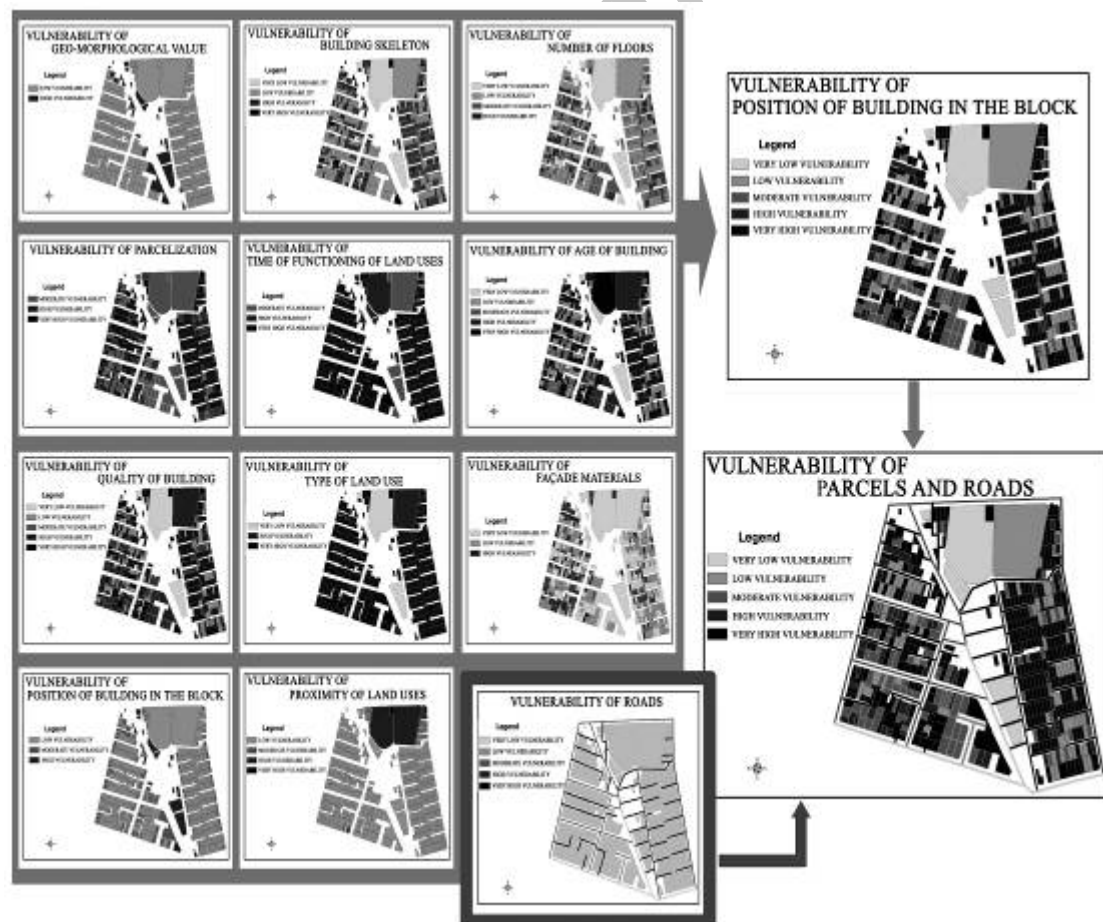
Fig. 2: Map of modeling stages of vulnerability of the area under study

To give a measure of vulnerability of the area under study (a part of municipality district 10 of Tehran), 11 factors have