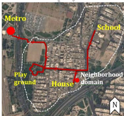
Fig. 4: The track of inspection in the Javanmard-Ghassab.

This method requires spending relatively significant amounts of time as it needs preparing and gaining the children’s trust in order to achieve the desired outcome. In addition, the coordination of times and site visits with children takes much time. Walking through the meeting neighborhood, there are side elements that reduce the children’s focus, however, like interviews, this method raises the feeling of being