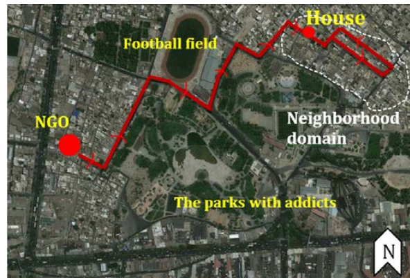
Fig. 5: The track of inspection in the Darvazeh-Ghar.