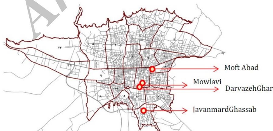
Fig. 1: The locations of case studies in Tehran

Drawing: This method was used subjectively through holding