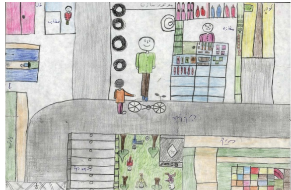
Fig. 3: A child drawing "a good city": a neighborhood without cars"