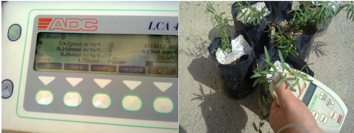
Fig. 1. Measurement of seedlings traits subjected to different devices.