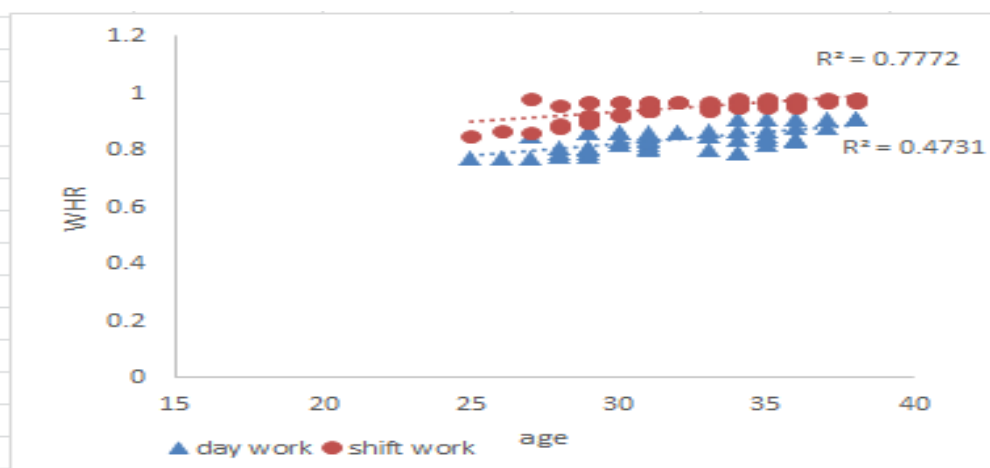
Figure 3: Linear regression (scatter plot) of age with waist-hip ratio in day and shift workers

observed in WHR of day workers, but a rapid change was observed in WHR of shift workers.