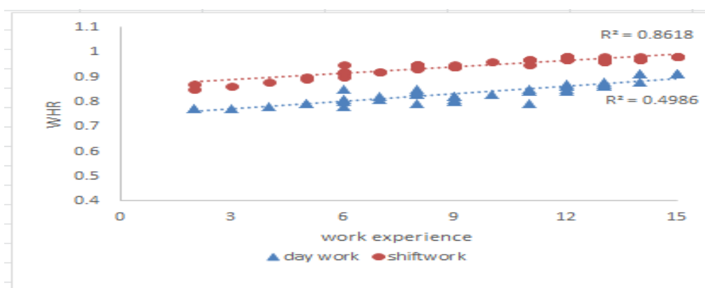
Figure 4: Linear regression (scatter plot) of work experience with waist-hip ratio of day and shift workers