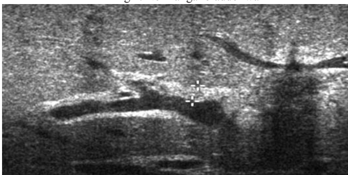
Fig 3. Objective criteria of triangular cord sign in biliary atresia seen on scan