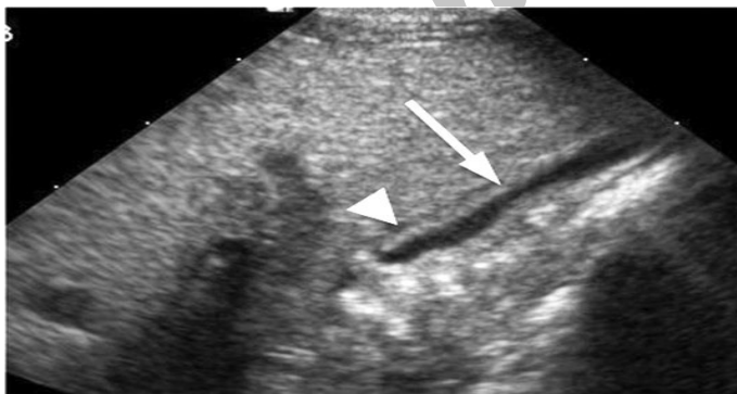
Fig 2. Normal gallbladder wall

* Positive predictive value ** Negative predictive value