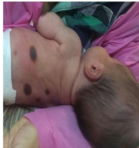
Figure 1. Nevus extending to the whole body

respectively. His appearance was good in general while his blood pressure, other vital signs, and heart sounds were normal as well as other chest exams. No organomegaly was detected in the abdominal physical examination. He was diagnosed with a prenatal ultrasonographic diagnosis of hydrocephalus and he had wide fontanels on his physical examination. There were nine well defined, non-hairy, hyperpigmented nevi with regular borders seen all over his body (figures 1a, b). Three giant nevi were observed at the lower back. The nevi biopsy confirmed Neurocutaneous melanosis.