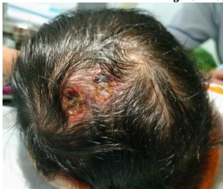
Figure 2. Crusting and scab formation on the lesions (the 5th day)