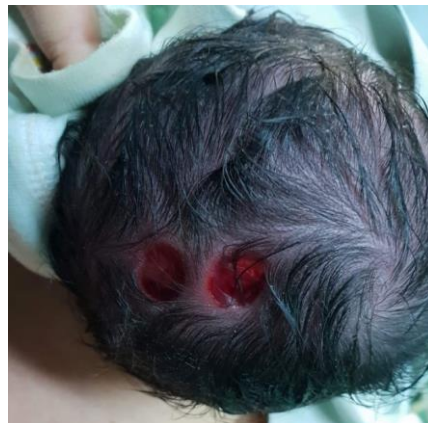
Figure 1. Lesions in a one-day-old female infant

A follow-up examination was performed after 12 months and two small round, white, well-demarcated, atrophic, hairless lesions, 1-1.5 cm in diameter were detected on the vertex at the location of the former defect (Figure 3).