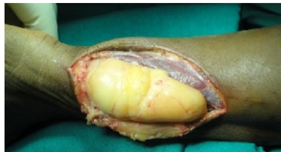
Fig. 3: Lipomatous appearance of the tumor.

block with tourniquet control. Longitudinal incision was made on the ulnar border of the distal forearm. The FCU was stretched, and displaced outwards. On reflecting the FCU, the mass was exposed (Figure 3).