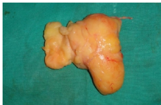
Fig. 4: Resected lipoma on the table.

Grossly, the mass was yellowish in color, lipomatous and multilobulated. The mass was gradually dissected (Figure 4). It extended from interosseous membrane on volar side to the interosseous membrane on the dorsal side encasing the entire distal ulna. As the ulnar neurovascular pedicle was at some distance from the mass and appeared largely uninvolved, no further exploration or neurolysis was considered.