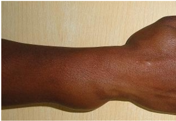
Fig. 1: Gross appearance of bulged tumor.

numbness at palmar aspect of fingertips in the ulnar nerve territory of the right hand since the past four months. She also complained of an asymmetric progressive swelling of her right distal forearm since the past two years. Physical examination revealed a soft tissue swelling localized to the ulnar border of the distal forearm extending volarwards and dorsally. The mass was non-tender and did not transilluminate. The grip strength, adduction and abduction and range of motion were symmetrical in both the hands (Figure 1).