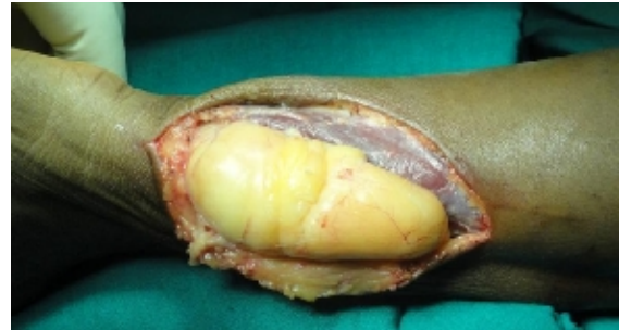
Fig. 3: Lipomatous appearance of the tumor.

block with tourniquet control. Longitudinal incision was made on the ulnar border of the distal forearm. The FCU was stretched, and displaced outwards. On reflecting the FCU, the mass was exposed (Figure 3).