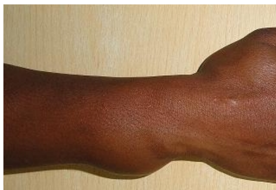
Fig. 1: Gross appearance of bulged tumor.

numbness at palmar aspect of fingertips in the ulnar nerve territory of the right hand since the past four months. She also complained of an asymmetric progressive swelling of her right distal forearm since the past two years. Physical examination revealed a soft tissue swelling localized to the ulnar border of the distal forearm extending volarwards and dorsally. The mass was non-tender and did not transilluminate. The grip strength, adduction and abduction and range of motion were symmetrical in both the hands (Figure 1).