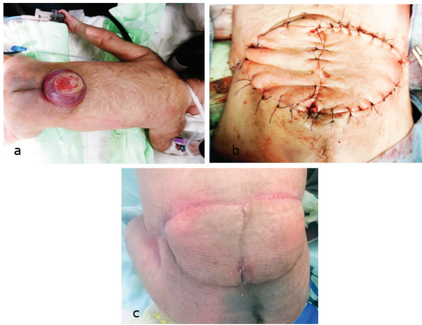
Fig. 2: a. 3 weeks old boy with myelomeningocele, b. Early postoperative, c. 6 months postoperative.