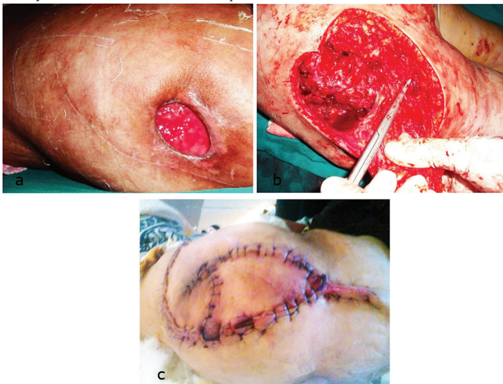
Fig. 1: a. Patient with trochanteric pressure sore, b. Elevation of the rotation flap on its pedicle, c. Postoperative with complete healing of the flap

A 42 year-old overweight woman presented with big sacral bed sore occupying the entire buttock associated with bilateral trochanteric