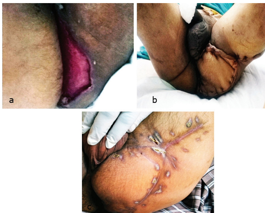
Fig. 3: a. Patient with wound in ischial area after necrotizing fasciitis, b. Early postoperative, c. 6 months postoperative

pressure sore. The patient was diabetic (on oral hypoglycemic) and paraplegic (history of stroke with previous deep venous thrombosis). The patient underwent bilateral V-Y flaps to cover the sacral pressure sore. After one week, the patient started to develop disruption in the center of the wound. Then, for successive 3 weeks, flap necrosis, seromas and hematomas developed in the wound. The wound was managed conservatively