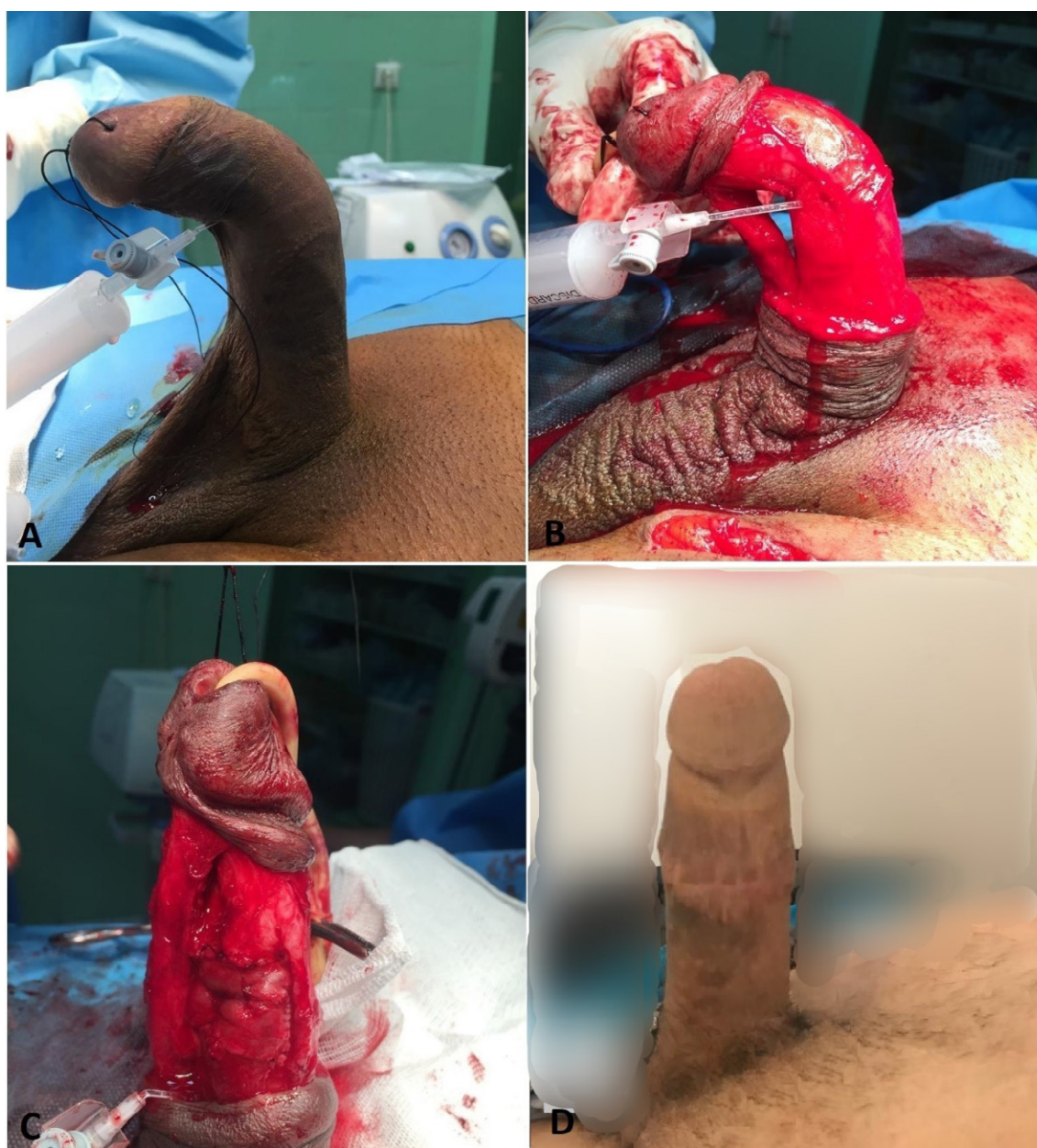
Figure 2: Pre-operational deviation. B) Artificial erection. C) The initial reduction of angle. D) After six months.