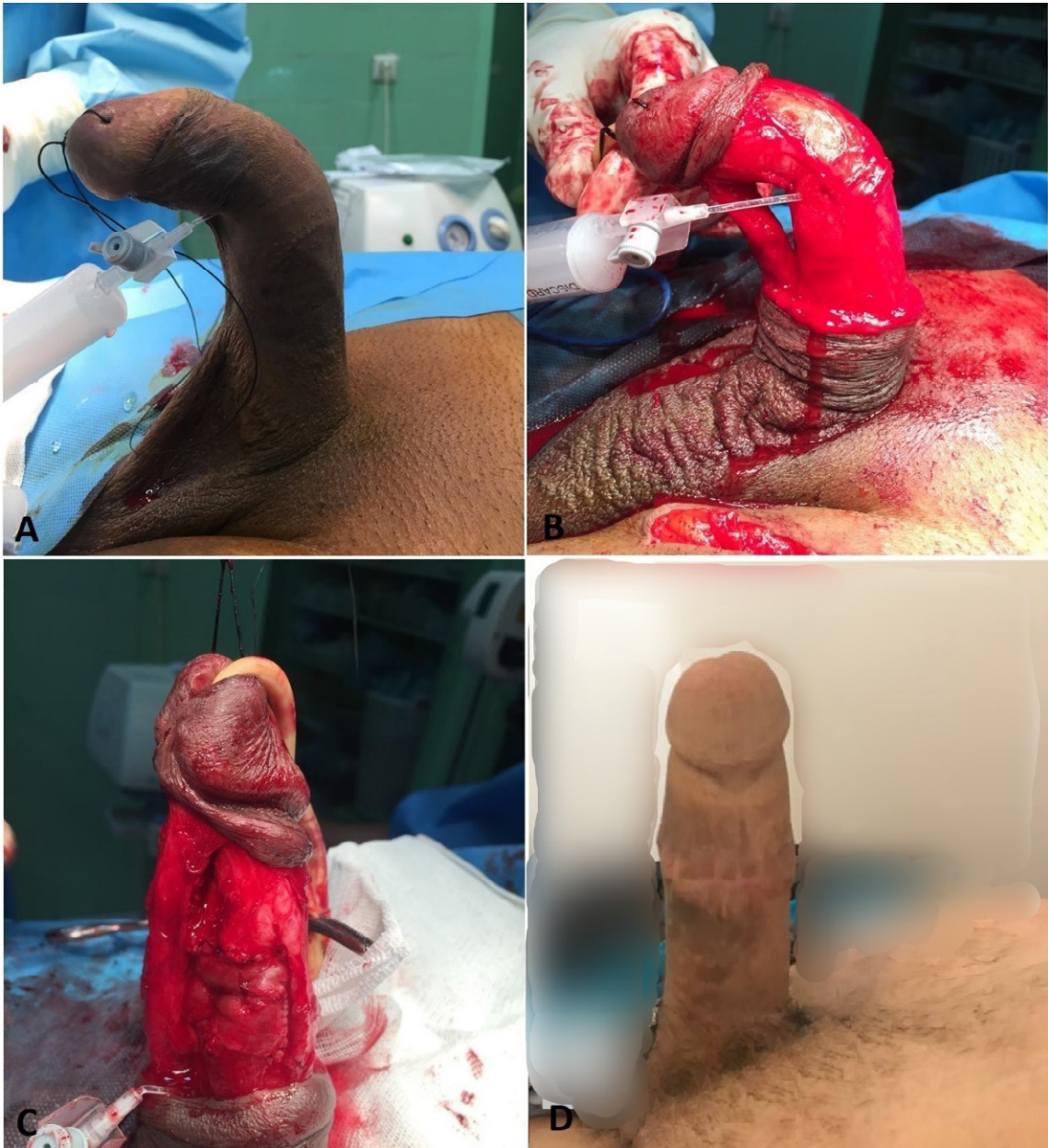
Figure 2: Pre-operational deviation. B) Artificial erection. C) The initial reduction of angle. D) After six months.