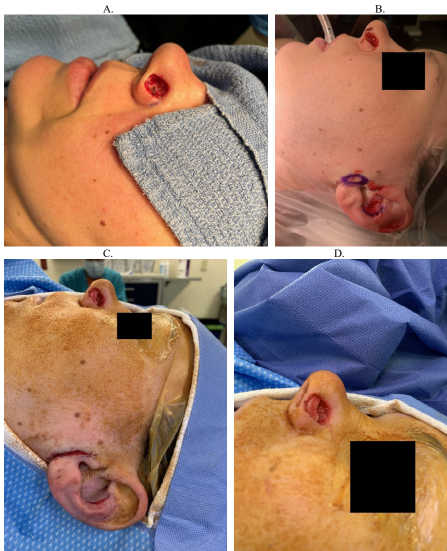
Figure 1: Reconstruction of nasal ala surgical defect post Mohs micrographic surgery. (A) Surgical defect on nasal ala. (B) Markings for grafts. (C) Surgical incisions for grafts. (D) Conchal cartilage graft in nasal ala.

The depicted 33-year-old female was referred with a 13x10 mm surgical defect immediately after Mohs micrographic surgery for excision of basal cell carcinoma. A conchal cartilage graft was used to span the width of the defect at the margin of the nostril. Soft tissue tunnels on either side of the defect were created to accommodate the medial and lateral ends of the graft. Finally, a pre-auricular full-thickness skin graft was used to provide excellent color match to the area. Due to the relatively small size of the defect, overlapping of the two free grafts does not typically affect healing. Our experience is consistent with long-term excellent results in preserving nasal valve function as well as acceptable aesthetic outcomes (Fig. 2).