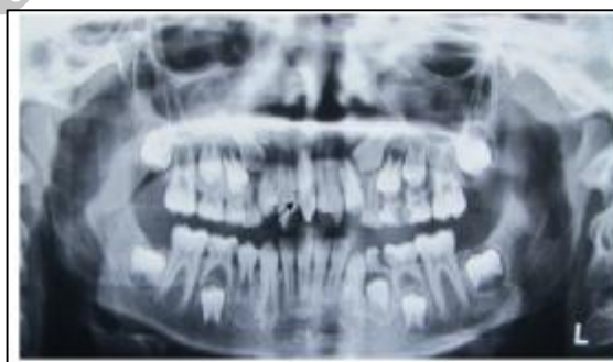
Figure 1. Erupted mesiodense in the anterior portion of the maxilla

Figures 1 and 2 reveal two dental anomalies that were detected in the present study.