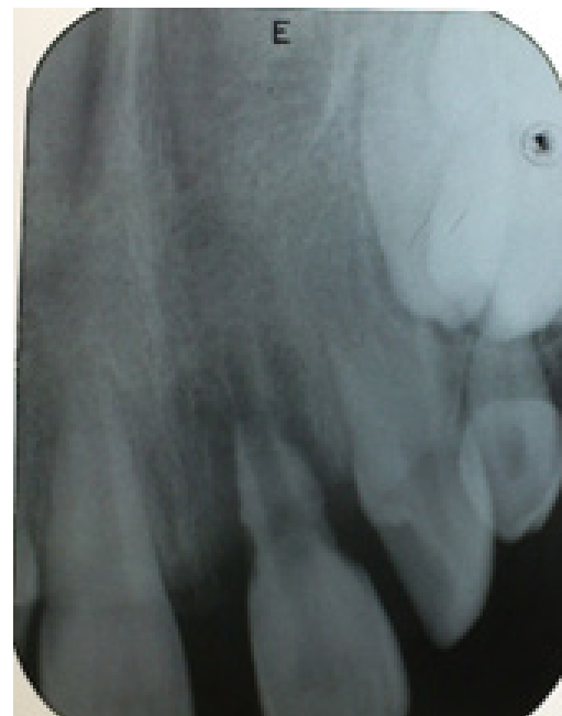
Figure 3. 6-week follow-up radiograph showing advanced external resorption

Tooth avulsion most often occurs in the anterior region of the maxilla, compromising a patient's esthetic,