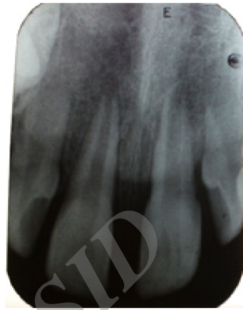
Figure 2. 3-week follow-up radiograph

The calcium hydroxide paste was replaced three times during a year because the resorption process was not arrested (Figure 4). Unfortunately, the patient failed to present as scheduled for follow-up appointment during the second year after the initial visit. After two years, the patient came back to the clinic. The tooth coronal seal was compromised. An intra-oral periapical radiograph was taken (Figure 5). According to the consultation with the endodontic department of Hamadan University of Medical Sciences (Hamadan, Iran), the tooth 21 was hopeless due to extensive root resorption and possible root perforation. However, with the parents' consent, the calcium hydroxide paste was removed and the canal was filled with Triple Antibiotic Paste (TAP) containing metronidazole, ciprofloxacin, and minocycline. The paste was changed monthly for a period of 3 months. After 3 months, the paste was changed for the last time, and it was then allowed to remain in the tooth. The chamber was sealed with resin-modified glass ionomer cement (Figure 6). Follow-up radiograph after 5 years revealed that the external root resorption had been arrested and replacement resorption was observed (Figure 7). In this