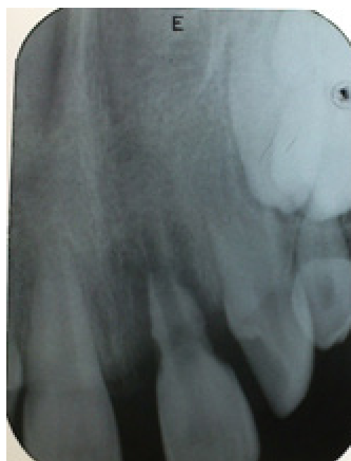
Figure 3. 6-week follow-up radiograph showing advanced external resorption

Tooth avulsion most often occurs in the anterior region of the maxilla, compromising a patient's esthetic,