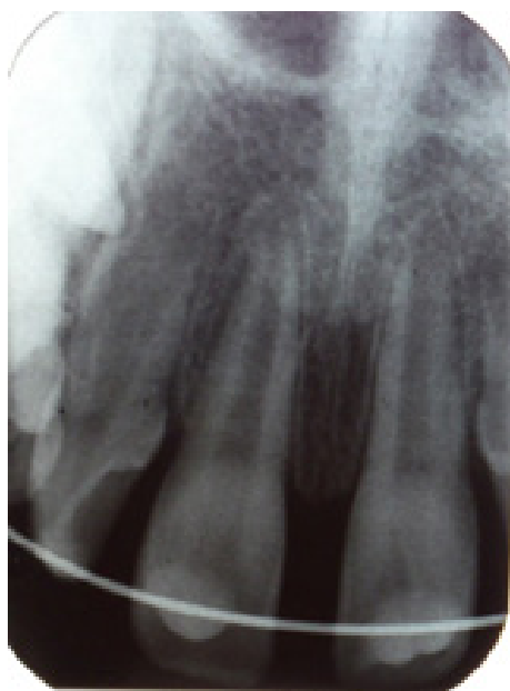
Figure 1. Post-splinting radiograph