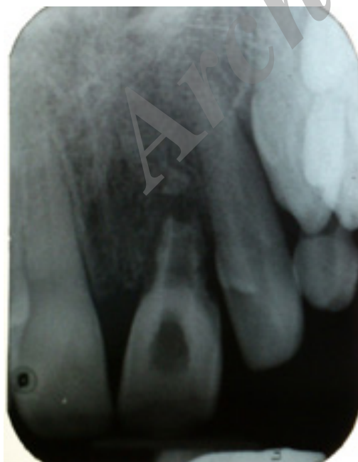
Figure 5. 2-year follow-up radiograph

In closed apex teeth, prophylactic endodontic therapy should be undertaken within 7-10 days after replantation [8]. However, for teeth with wide open apex, careful observation is recommended as there is a chance for revascularization. If any signs of necrosis such as root resorption are diagnosed, root canal therapy should be per-