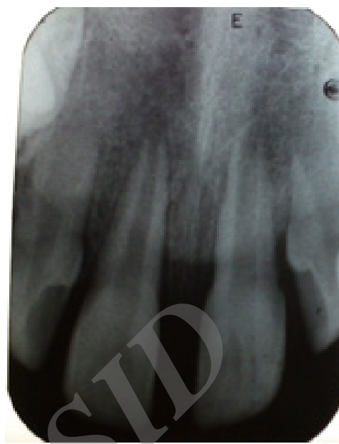
Figure 2. 3-week follow-up radiograph

The calcium hydroxide paste was replaced three times during a year because the resorption process was not arrested (Figure 4). Unfortunately, the patient failed to present as scheduled for follow-up appointment during the second year after the initial visit. After two years, the patient came back to the clinic. The tooth coronal seal was compromised. An intra-oral periapical radiograph was taken (Figure 5). According to the consultation with the endodontic department of Hamadan University of Medical Sciences (Hamadan, Iran), the tooth 21 was hopeless due to extensive root resorption and possible root perforation. However, with the parents' consent, the calcium hydroxide paste was removed and the canal was filled with Triple Antibiotic Paste (TAP) containing metronidazole, ciprofloxacin, and minocycline. The paste was changed monthly for a period of 3 months. After 3 months, the paste was changed for the last time, and it was then allowed to remain in the tooth. The chamber was sealed with resin-modified glass ionomer cement (Figure 6). Follow-up radiograph after 5 years revealed that the external root resorption had been arrested and replacement resorption was observed (Figure 7). In this