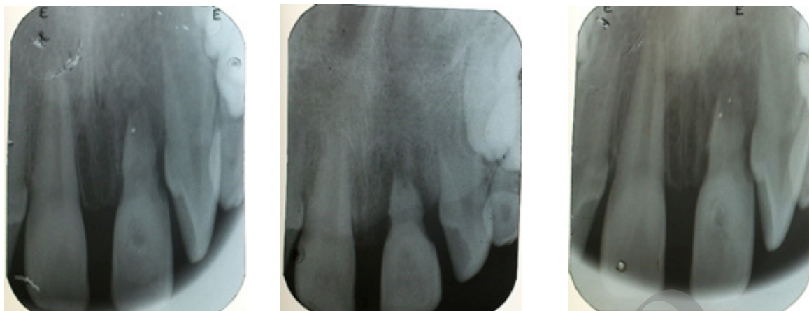
Figure 4. Interim root canal dressing with calcium hydroxide during the first year after initial visit