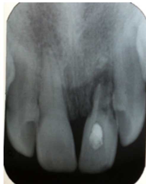
Figure 6. Root canal dressing with Triple Antibiotic Paste (TAP)