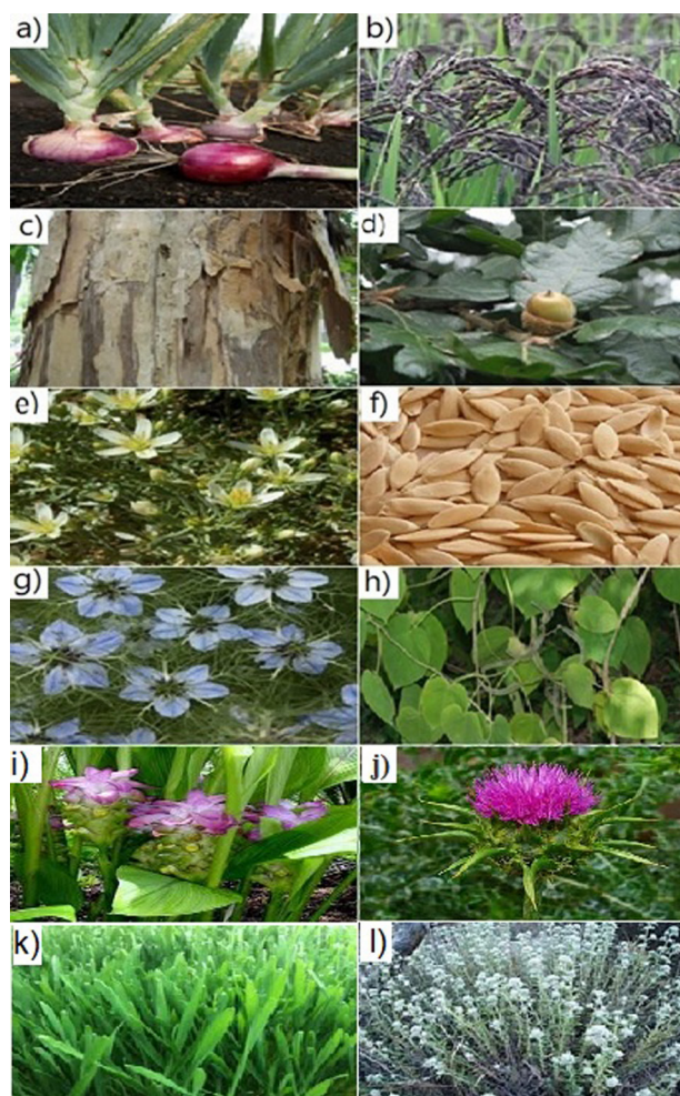
Figure 1. a) Allium ascalonicum , b) Black rice, c) Cinnamon, d) Oak, e) Peganum harmala , f) Cucumis melo seeds, g) Nigella sativa , h) Marsdenia tenacissima , i) Curcuma longa , j) Silybum marianum . k) Wheatgrass, l) Teucrium polium .

The Teucrium polium (Figure 1l) is a wild-growing flowering plant found in Europe and southwestern Asia. T. polium has been applied in Iranian traditional medicine for treating multitude of diseases due to its pharmacological properties. This plant has been reported to have hypolipidemic 62 hypoglycaemic 63 anti-nociceptive 64 anti-oxidant, anti-bacterial, anti-fungal, anti-septic, and anti-inflammatory 65 potentials. There has also been an anti-angiogenic feature of T. polium extract reported which is attributed to a decreased NO secretion by HUVECs. Aside from blocking NO secretion and proliferation inhibition, T. polium can also trigger apoptosis by increasing Bax (a pro-apoptotic factor) expression and decreasing Bcl-2 expression (an anti-apoptotic factor). 63 In 2019, Askari et al reported that the T. polium extract inhibited HUVEC cell growth in vitro and also VEGF secretion. These results show that T. polium could be a candidate for angiogenesis prevention. 66