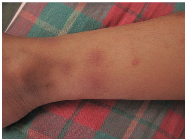
Figure 1. Erythematous Plaque Like Skin Lesions in the Legs

the report of the BACTEC blood culture, which revealed the growth of Cryptococcus neoformans .