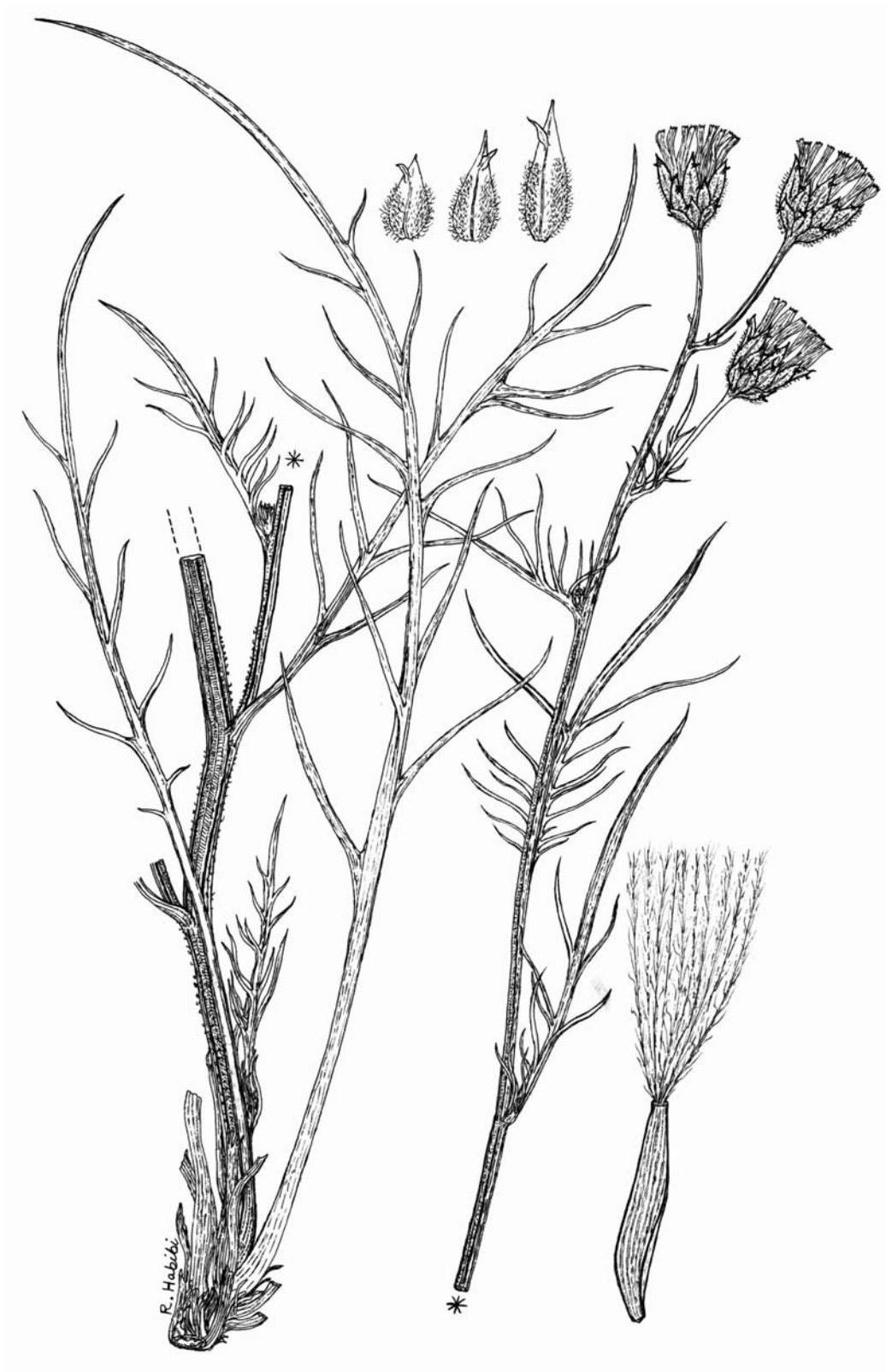
Fig .1. Scorzonera luristanica var. lanata ( \times 0.7 ), achene ( \times 3.5 ) phyllaries ( \times 1.4 ).