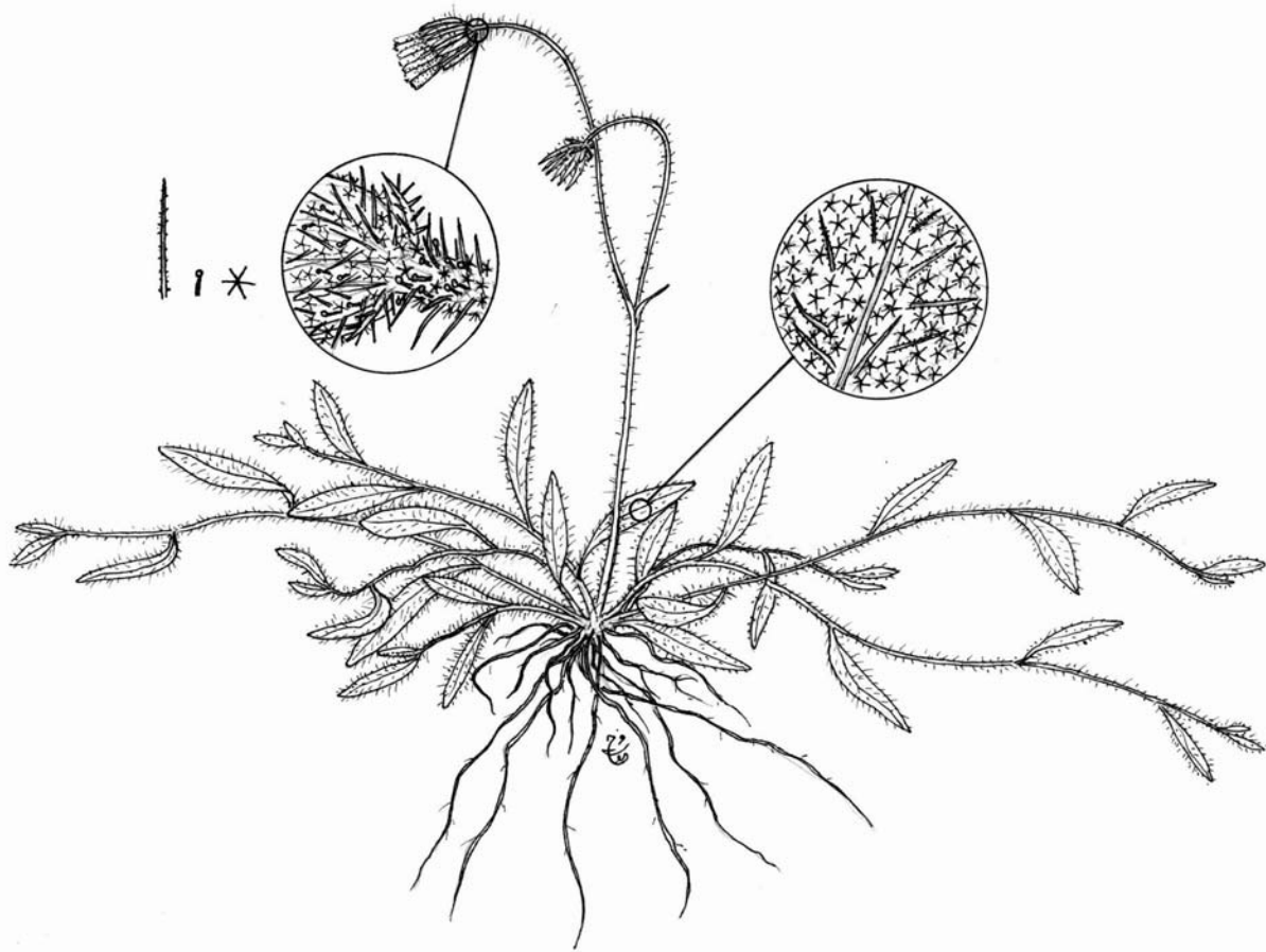
Fig. 1. Hieracium xmatrense (x 0.83).

This species differs from H. hoppeanum in having several capitula on each stem and its leaves with dense stellate hairs on both sides (similar to H. hoppeanum with broad phyllaries) and from H. verruculatum in having less and smaller stem leaves. The species is distributed in Caucasus, East Transcaspia (Juxip 1960; Sell & West 1975).