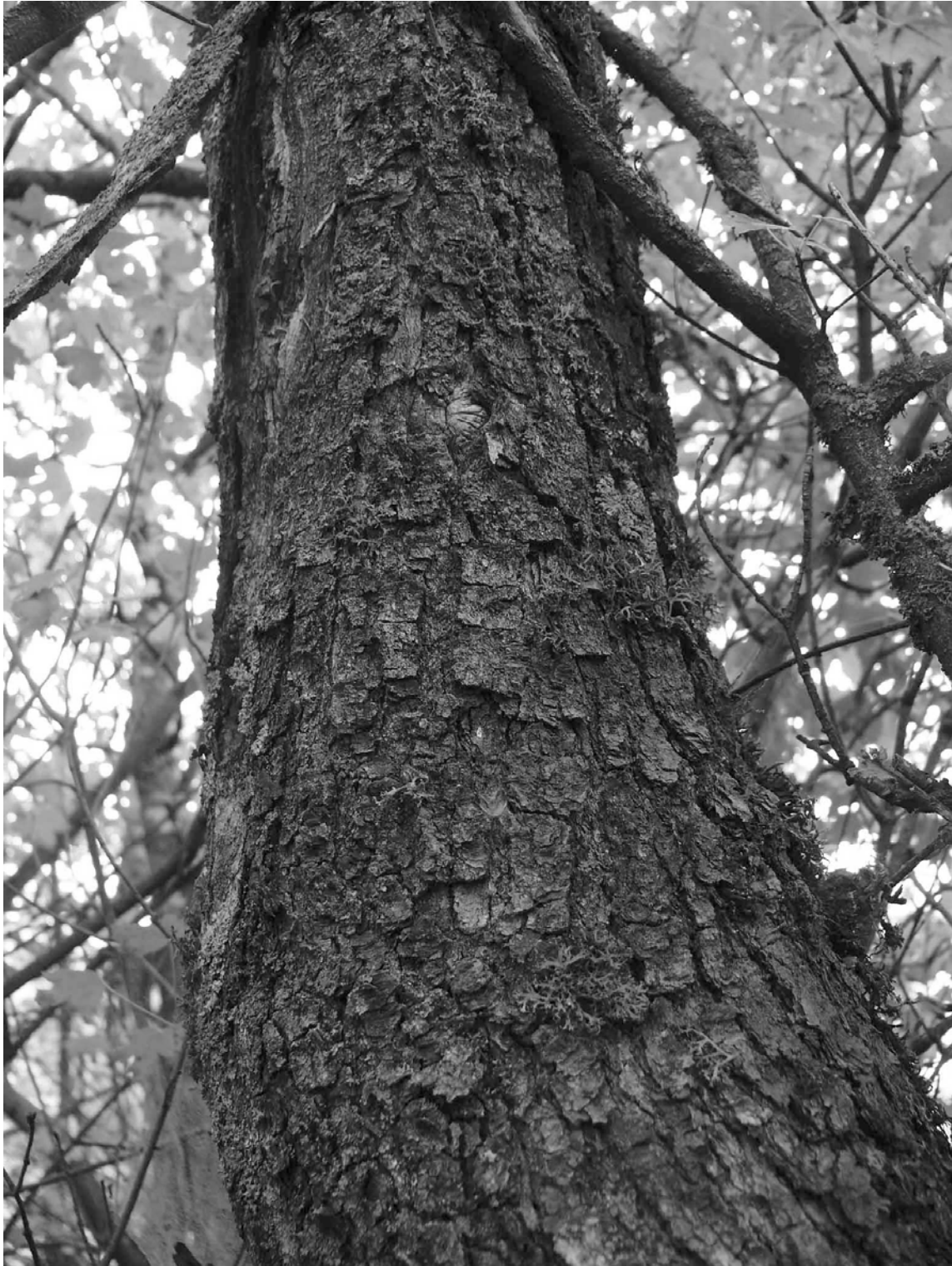
Fig. 3. Trunk of Acer hyrcanum .