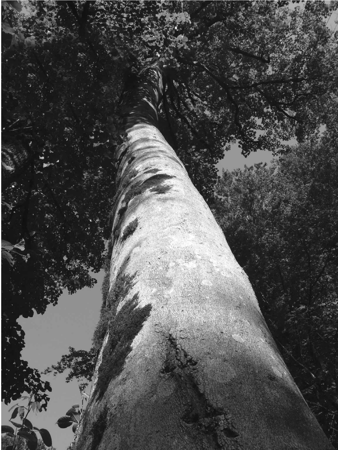
Fig. 2. Trunk of Acer mazandaranicum .