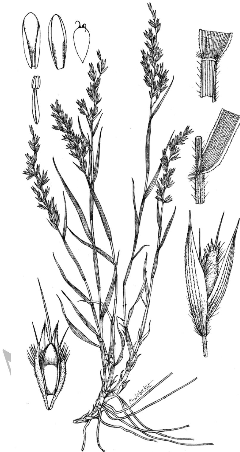
Fig. 1. Centropodia forskalii subsp. forskalii ( \times 0.5 ); spikelet, right ( \times 4.5 ); floret, left ( \times 8 ); ligule ( \times 2.2 ); lemma and palea ( \times 5 ); anther ( \times 10 ); ovary ( \times 5 ).