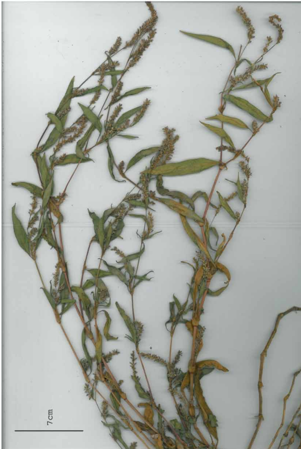
Fig. 1. Persicaria lapathifolia subsp. nodosa .