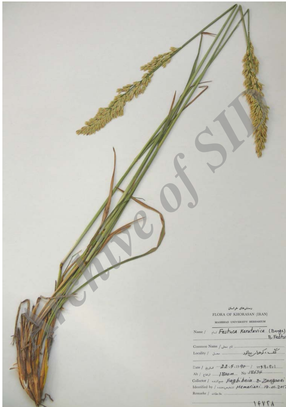
Fig. 1. Festuca karatavica , a new record for the flora of Iran, -18634 (FUMH).