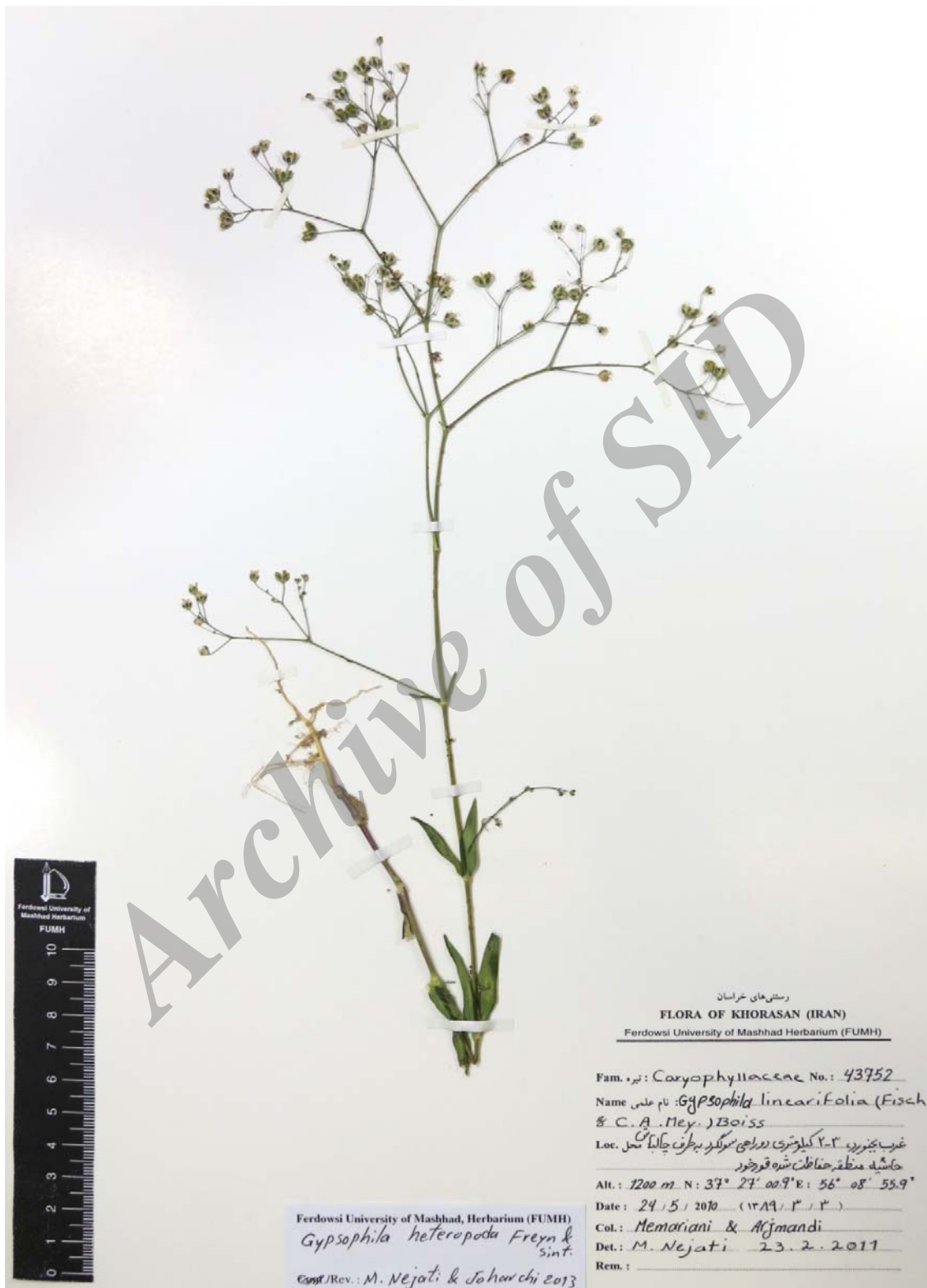
Fig. 1. Image of herbarium specimen of Gypsophila heteropoda .