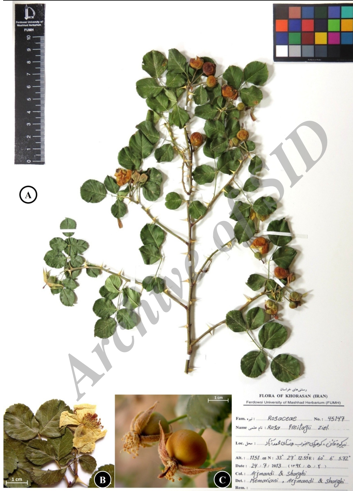
Fig. 1. Rosa freitagii Ziel. A, Herbarium specimen (45147, FUMH). B, close-up view of herbarium specimen (30860 FUMH) showing the flower, columnar style, prickles and round shape of the leaflets; C, Early fruiting stage in natural habitat (45147 FUMH) showing the entire sepals and columnar shape of styles.