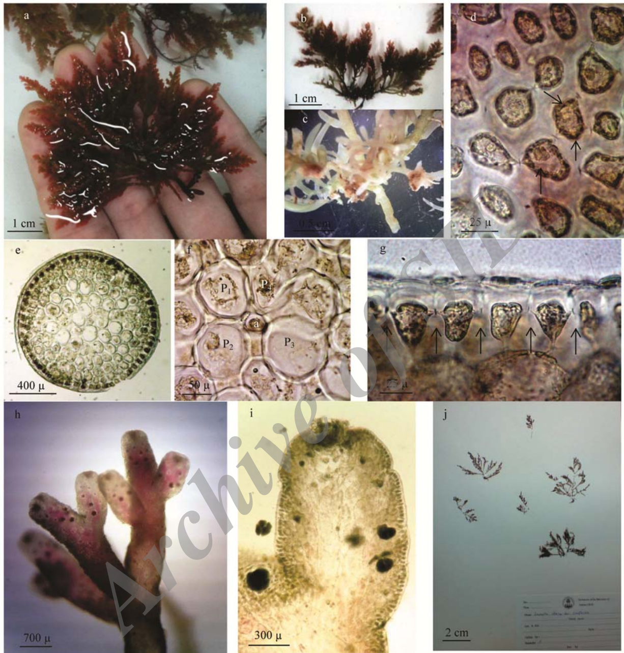
Fig. 3. Laurencia obtusa var. compacta : a, habit; b&c, axes and holdfast; d, surface image showing one to two corpi per epidermal cell; e & f, transverse section through a vegetative axial showing an axial cell, a, with four pericentral cells(p); g, longitudinal section through an ultimate branchlet, showing epidermal cells, secondary pit connections (black arrows) and nonprojecting cortical cells; h, a tetrasporic branch; I, the detail of tetrasporic branchlet; j, herbarium specimen.