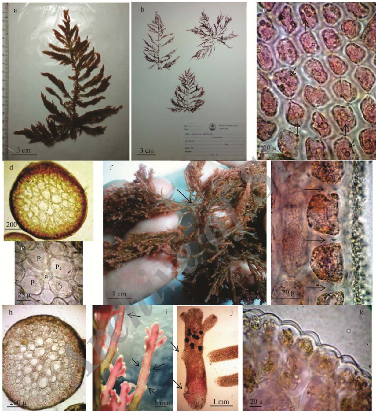
Fig. 4. Laurencia dendroidea J.Agardh. a & b, habit, c, surface image showing two corps en cerise per epidermal cell, d & e, transverse section through a vegetative axial showing an axial cell, (a) with four pericentral cells, (p), f) anastomosis, g, longitudinal section through an ultimate branchlet, showing epidermal cells and secondary pit connections (black arrows), h, transverse section of old portion of the thallus showing filling cells, i, detail of a branch showing scar of released branchlet (arrows), j, a tetrasporic branch, note scars of released branchlets (arrows), k, projecting cortical cells.

The algae colors range from dark red to orange-red but most are dark red color with very few plants showing slightly green main axes;