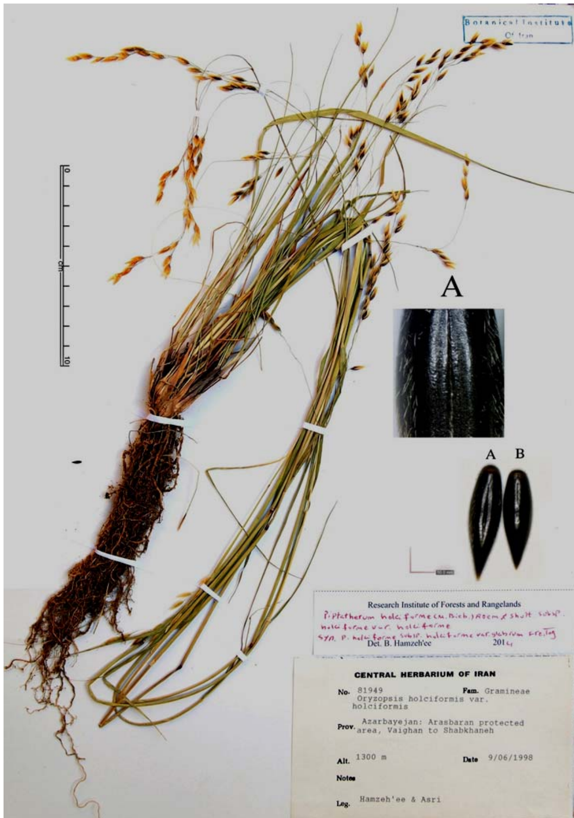
Fig. 3. Piptatherum holciforme subsp. holciforme var. holciforme . A, hairy lemma; B, glabrous lemma.