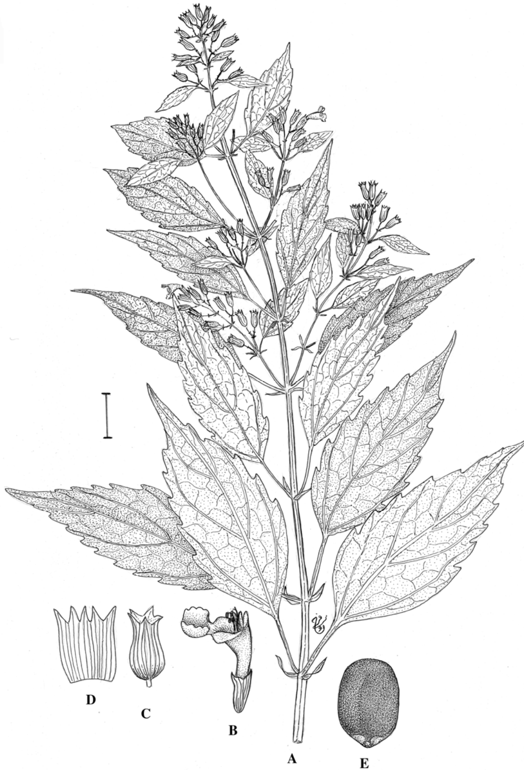
Fig. 1. Diagnostic morphological features of Nepeta wuana . A, habit; B, flower; C, calyx; D, calyx dissected; F, nutlet (scale bar = 2cm).