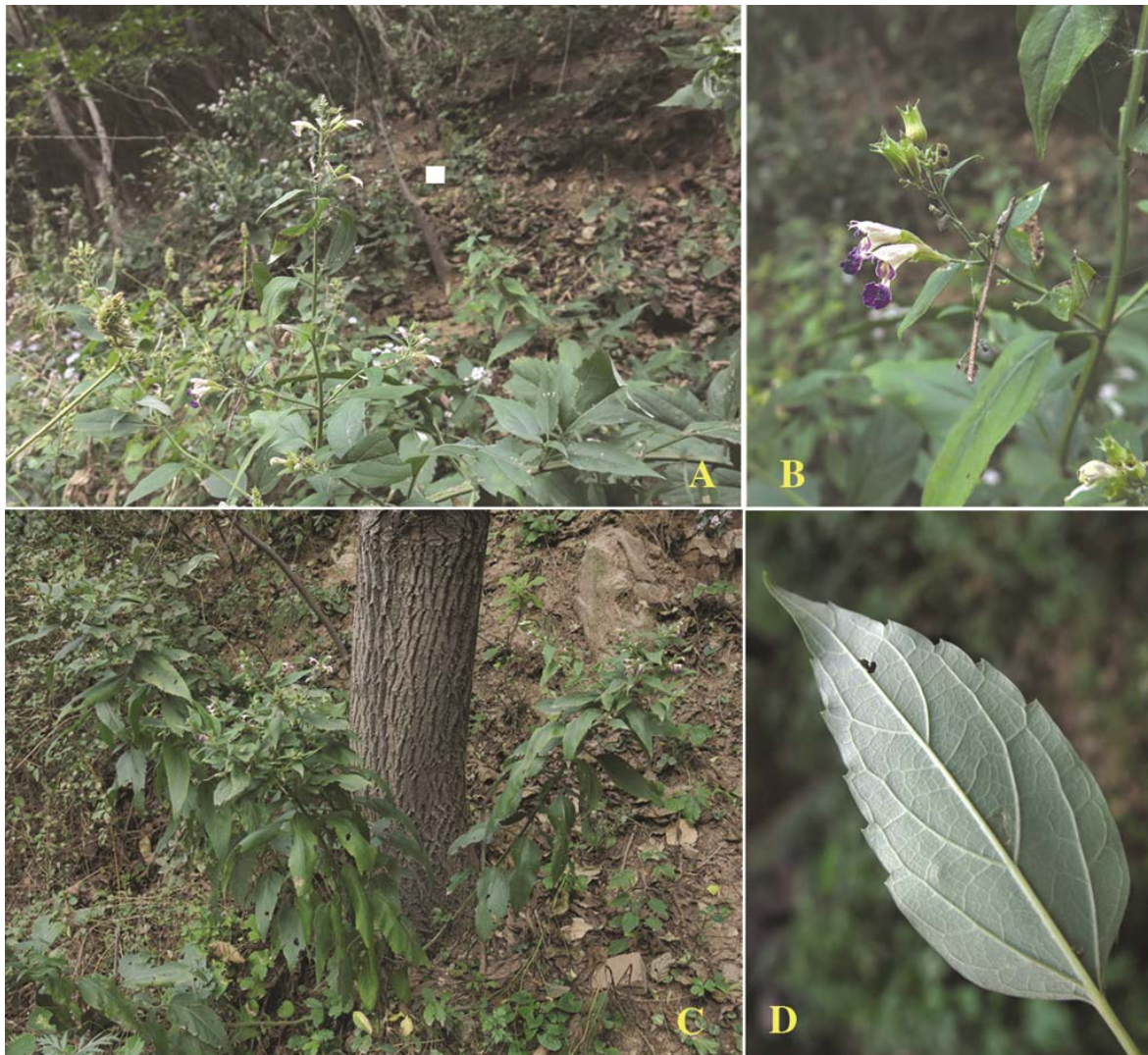
Fig. 2 Photos of Nepeta wuana . A. Branch; B. Inflorescence; C Habitat; D. Abaxial surface of leaf.

N. wuana vs. 1.5-3 \times 1-2 cm in N. sungpanensis ), shape of calyx lobes (subulate or triangular vs. triangular), color of flowers (white but purple in lower lip vs. blue).