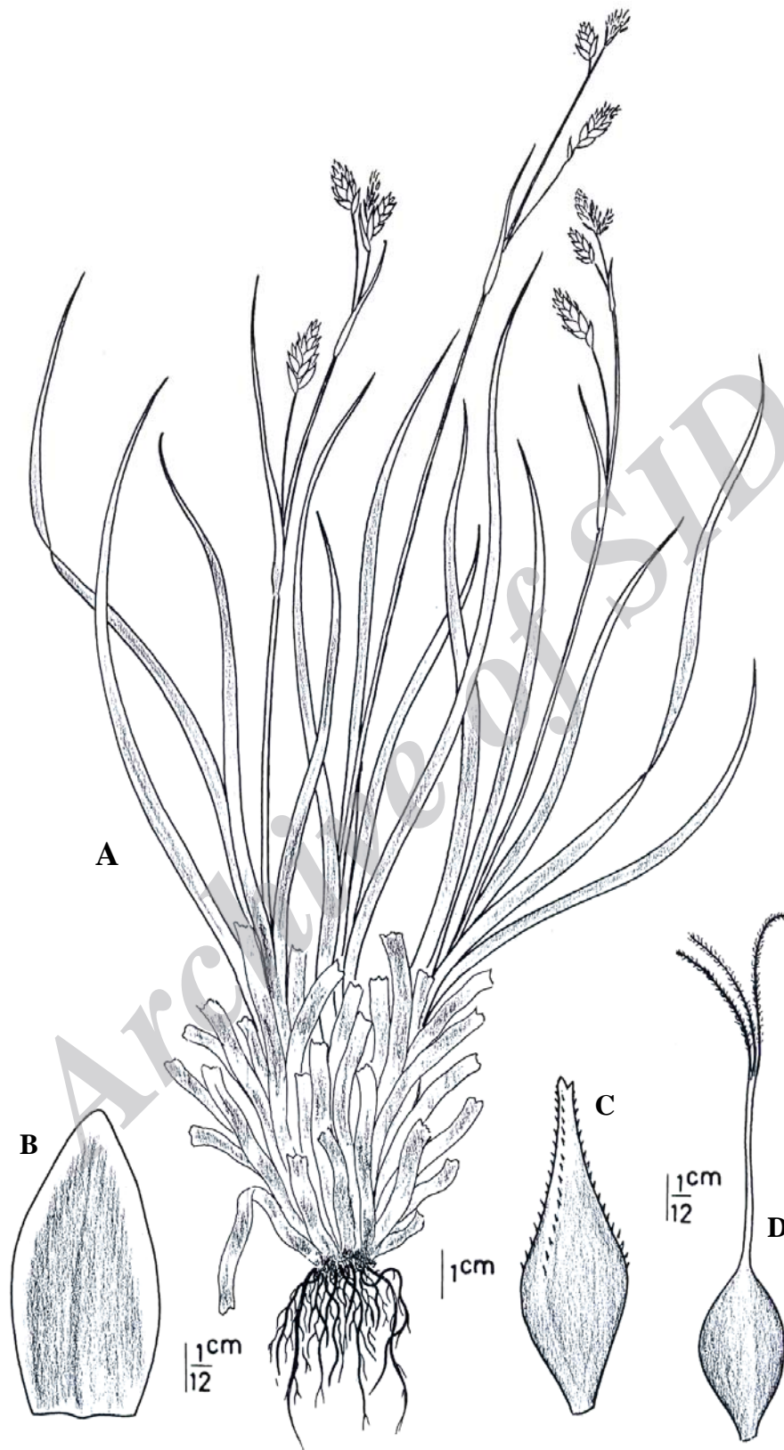
Fig. 1. Carex tristis . A, Habit; B, female glume; C, utricle; D, nut.