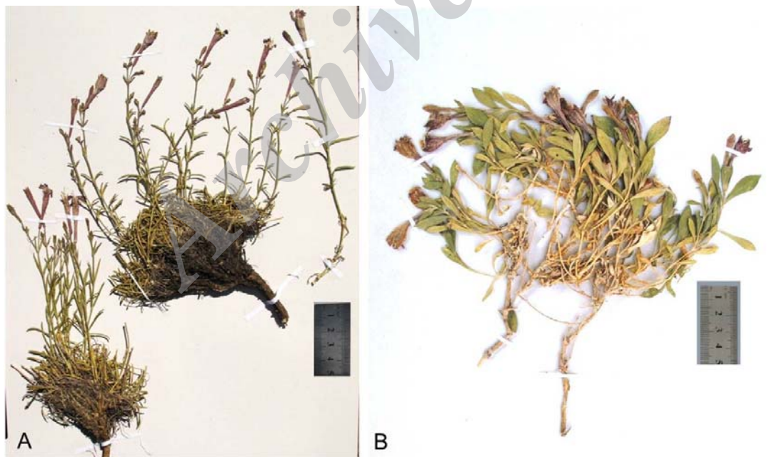
Fig. 3. Herbarium specimens of species studied. A, Silene mishudaghensis (Parsa Khangah SPNH-2445); B, S. araratica (Gholipour SPNH-322, Scale bar = 5 cm).