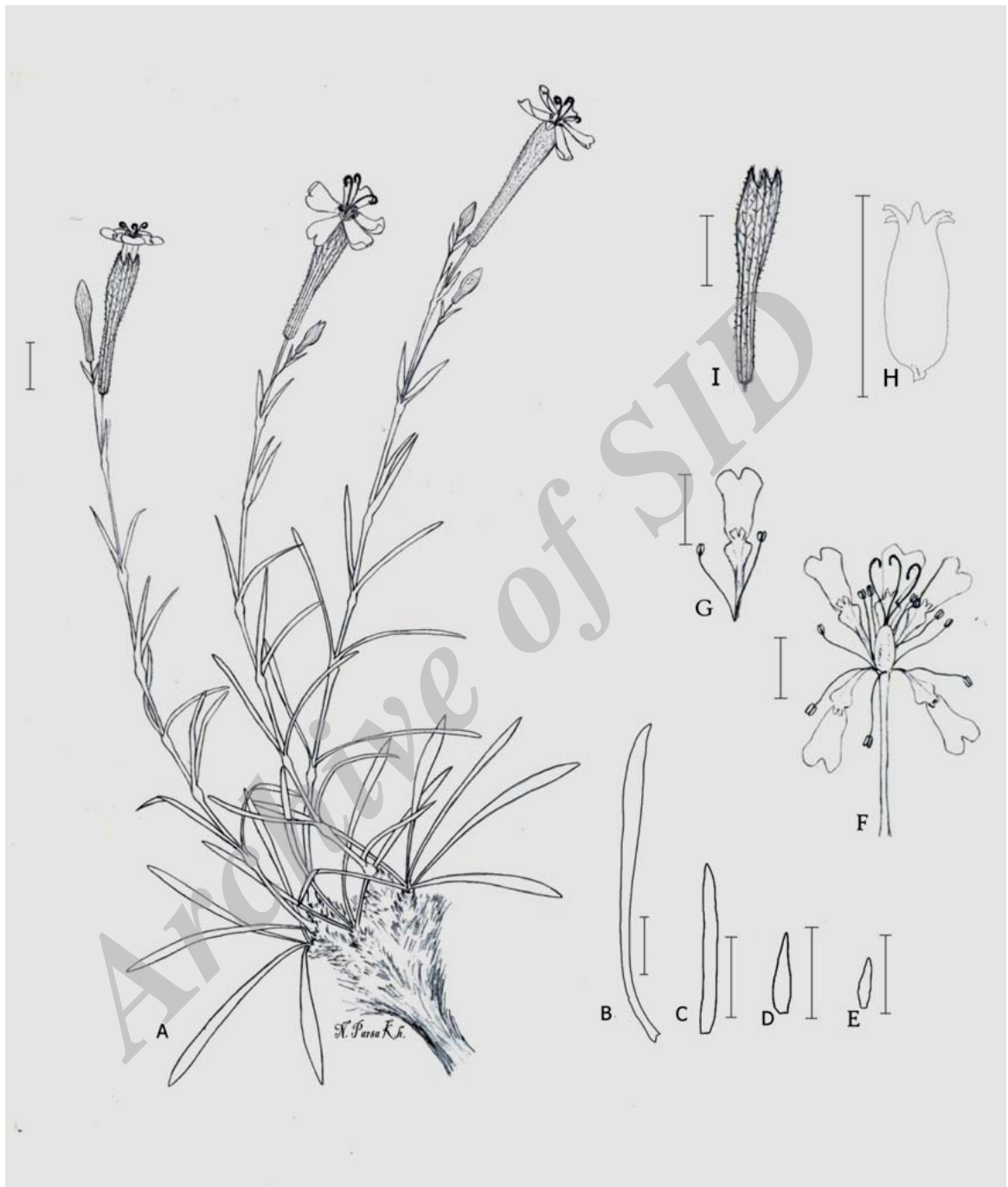
Fig. 1. mishudaghensis : A, habit; B, basal leaf; C, cauline leaf; D, alar bract; E, lateral bract; F, flower; G, Petal; H, capsule; I, calyx (Scale bar = 1 cm).