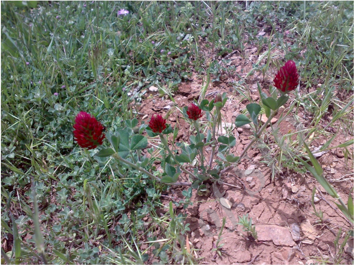
Fig. 1. Trifolium incarnatum in its habitat (photo by M. A. Tabad, 22 April 2015).