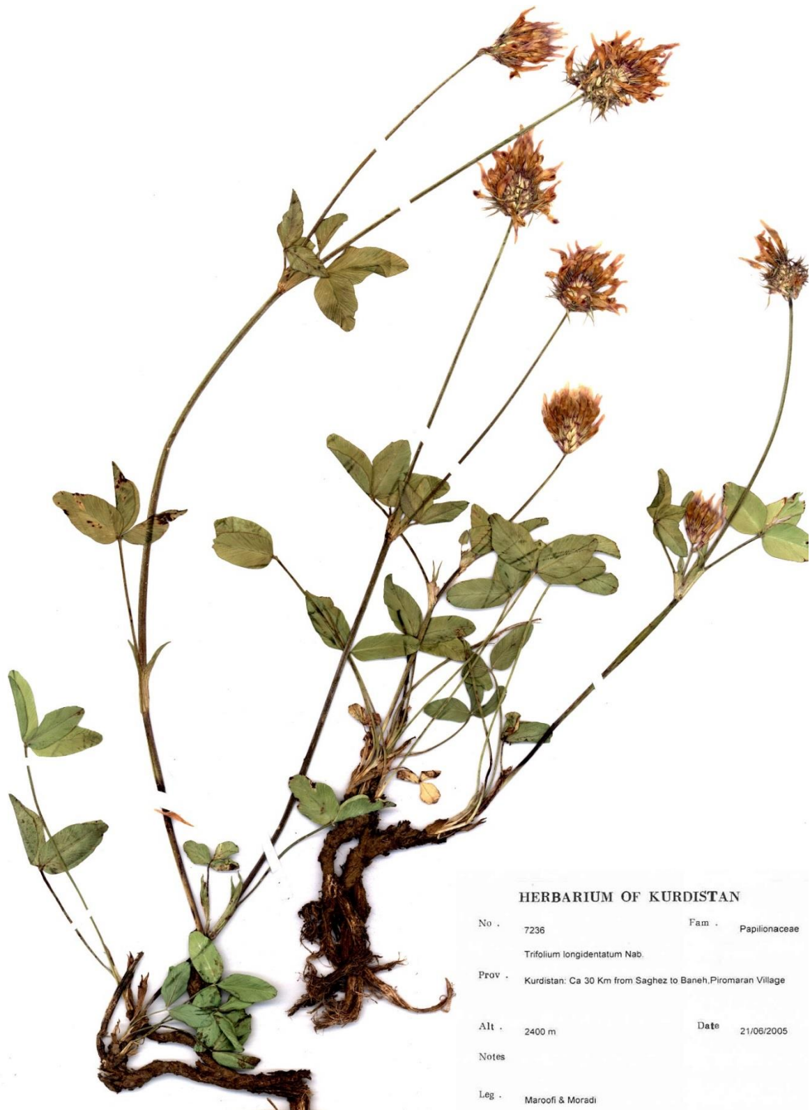
Fig. 1. Image of herbarium specimen of Trifolium longidentatum .