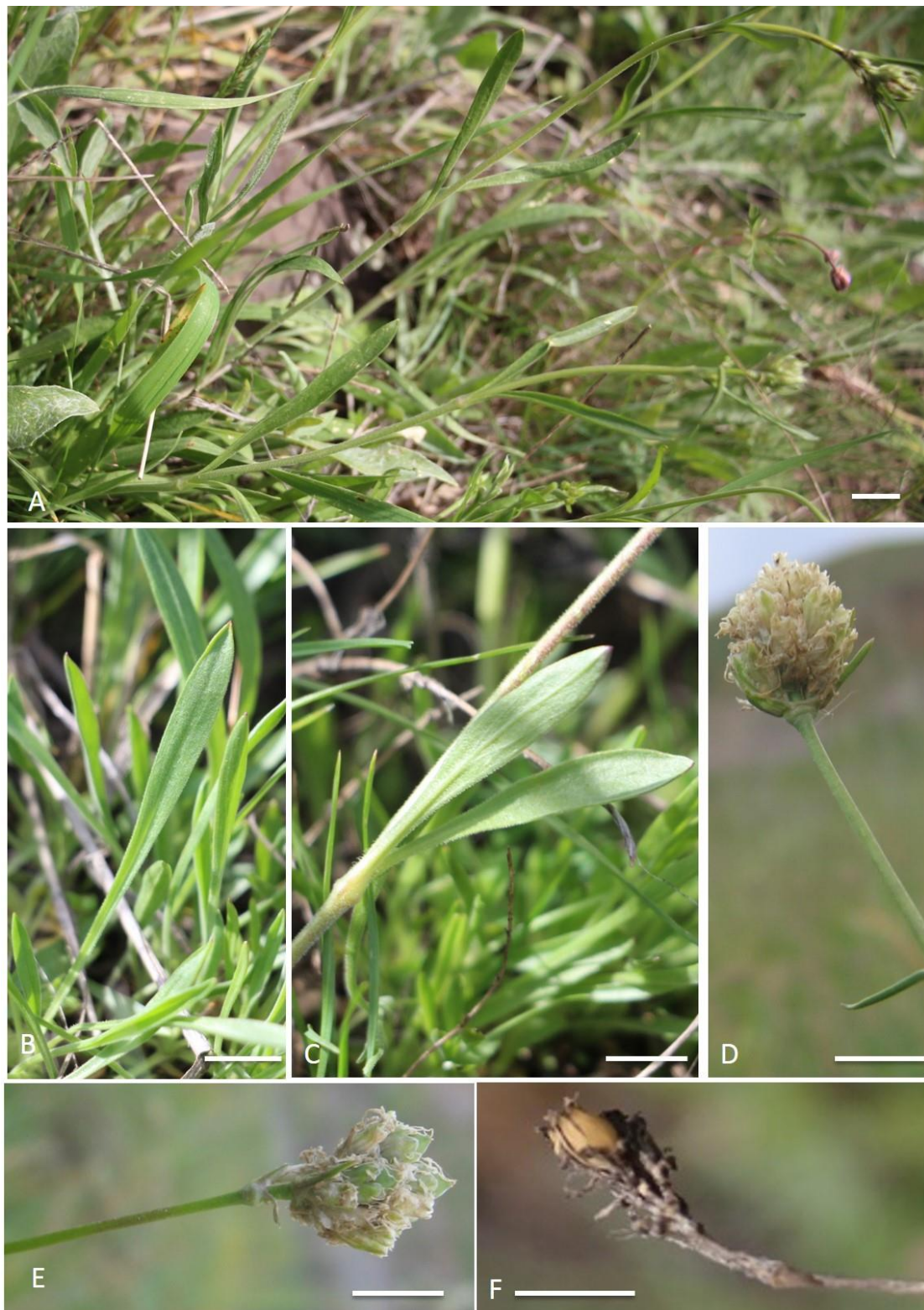
Fig. 1. Silene capitellata : A, Plant habit in natural habitat (SPNH-5617); B, basal leaf; C, cauline leaf; D, Inflorescence; E, inflorescence in fruiting time; F, capsule (scale bar 10 mm).