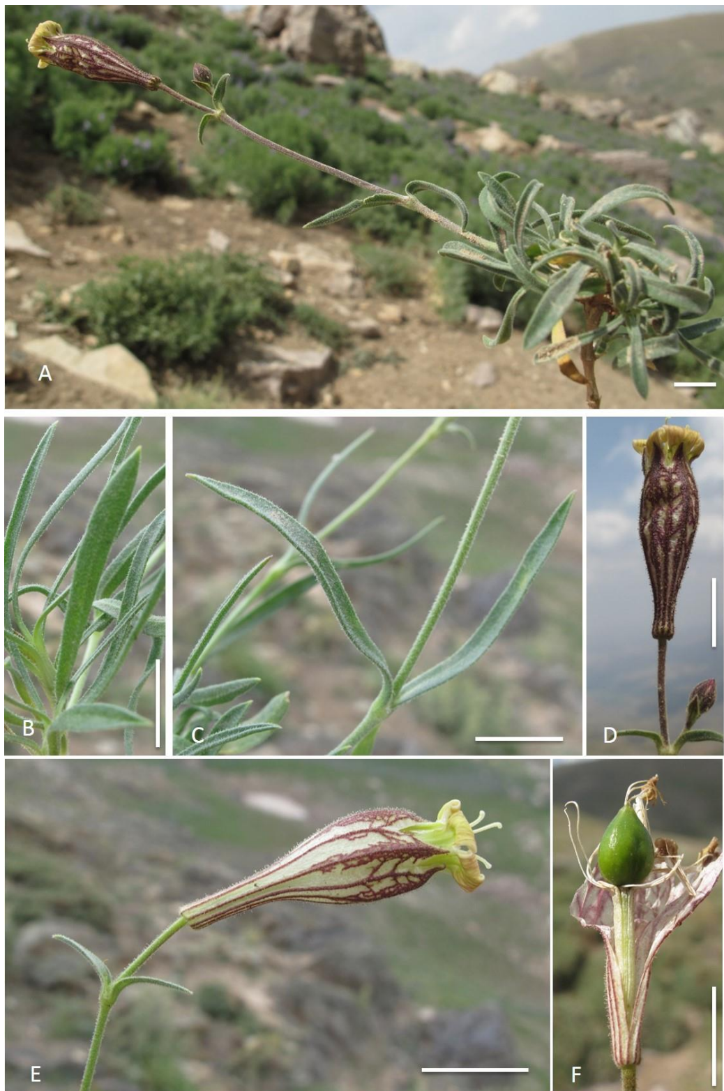
Fig. 3. Silene retinervis : A, Plant habit (SPNH-5707); B, basal leaf; C, cauline leaf; D, inflorescence; E, flower; f. unripe capsule and Antophore (scale bar 10 mm).