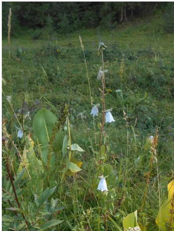
Fig. 1. Codonopsis clematidea in type locality.

After studies of herbarium materials in TASH, LE and MBG, a map of distribution of two Codonopsis species in Middle Asia was implemented (map. 1).