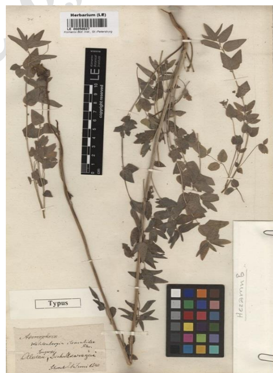
Fig. 2. Type specimen of Codonopsis clematidea (LE).