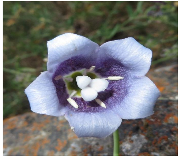
Fig.4. Flower of Codonopsis bactriana .