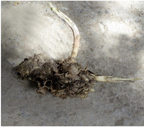
Fig. 3. Root of Codonopsis bactriana from Pamiroalaj.