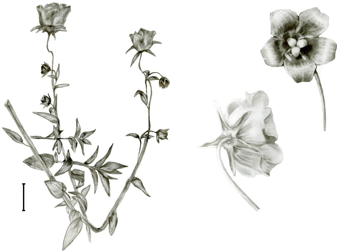
Fig. 7. Codonopsis bactriana F. O. Khass., U. H. Kodyrov & A. Myrz. sp. nov. , General habit and details. -Drawn from a plant of the type collection. Scale bar = 2 cm. (artist: Sitara H. Fayzullaeva).