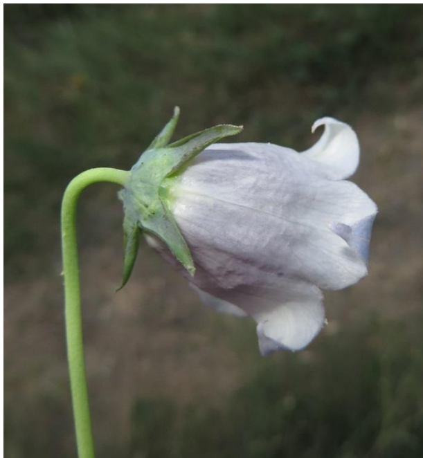
Fig. 5. Codonopsis bactriana from Pamir-Alay.