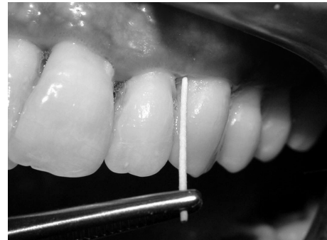
Fig-2- Collection of flora of the sulcus by the sterilised paper cone