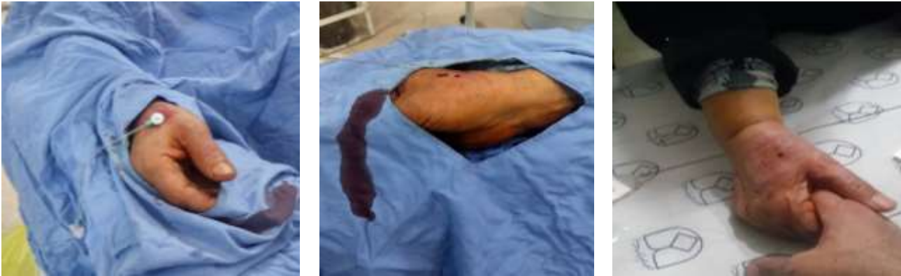
Figure 2. The first successful coronary angiography performed on deep palmar branch of radial artery in a 65-year-old man in 1 October 2016.

The presence of an appropriate pulse in the anatomical snuff box was verified by manual palpation. We used intravenous (IV) midazolam (1-2 mg) and sublingual trinitroglycerin (TNG) (0.4 mg) in most patients (to minimize patient stress and arterial spasm).