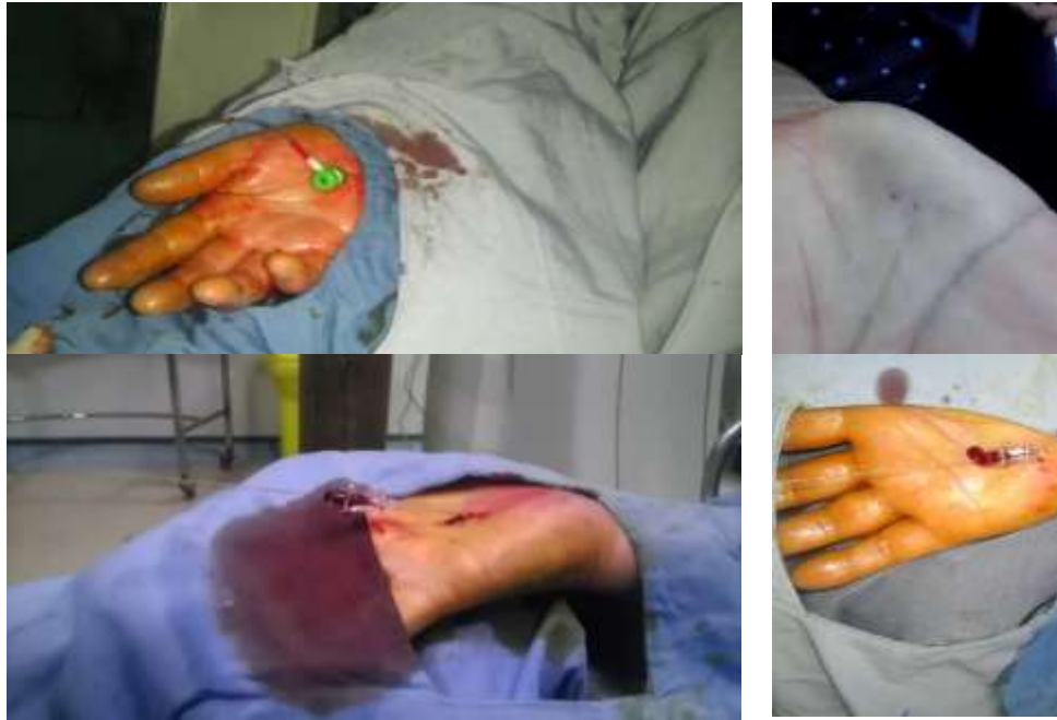
Figure 3. The first successful coronary angiography preformed on right superficial palmar branch of ulnar artery in a 64-year-old man in 15 October 2016.

Superficial palmar artery was punctured by 21G needle, and 0.018 guide wire was passed under fluoroscopy guide (skin incision was crucial before sheath insertion). Then, 4, 5, or 6 F sheath was inserted.