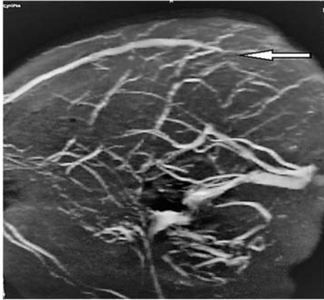
Figure 1. Superior sagittal sinus thrombosis (arrow) in magnetic resonance venography (MRV)

The patient was discharged in stable condition on oral Coumadin.