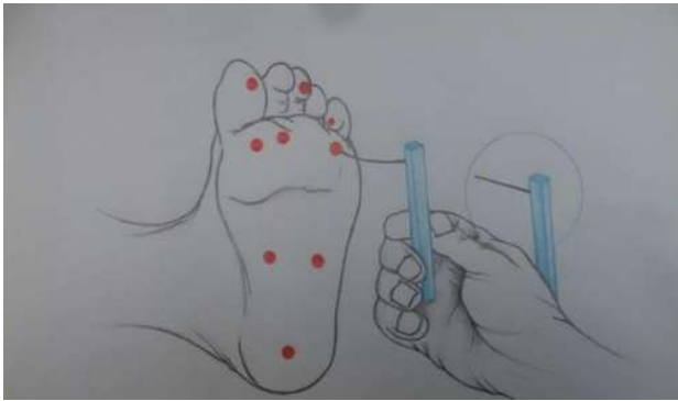
Fig. 1. Detected plantar points evaluation by Semmes Weinstein monofilament examination

measurement tool for assessing balance in post stroke patients [16]. Monofilament testing was used to assess plantar cutaneous sensation. The 5.07/10 g monofilament has been recommended as the best indicator to determine peripheral neuropathy of the feet [17,18]. Participants were in supine position, with closed eyes and had rested for 5 minutes before the test. The assessor put a flexible nylon with perpendicular angle to one of the 10 points plantar surface in no specific order, including: nine plantar sites (distal great toe, third toe, and fifth toe; first, third, and fifth metatarsal heads; medial foot, lateral foot, and