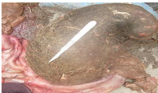
Fig 2. The stomach was completely filled with huge trichobezoar mass weighted 3800 grams.

(1.058), and increased cellularity dominated by degenerated neutrophils and macrophages, and many coccobacillus bacteria were seen in the Geimsa staining. The complete blood count showed elevated hematocrit (68%), sever leukocytosis (49000/ \mu l), neutrophilia, shift to left and toxic change. Biochemical evolution showed elevated globulin (6 mg/dl), BUN (134 mg/dl) and creatinine (5.2 mg/dl) level. Samples were obtained from esophagus, stomach, liver, spleen, small and large intestine and sent for histopathological examination. Necrosis and sloughing of the gastric mucosa (Fig. 4) and presence of fibrinopurulent exudate in the gastric serosa (Fig. 5) was reported. The gastric outlet obstruction and perforation, focal peritonitis and endotoxic shock was diagnosed as the main death factors based to the leukemoid reaction in hematological evaluation, cytological and histopathological findings. However surprisingly, except gradual weight loss; the animal did not show any obvious clinical sign of severe gastric impaction before death which could facilitate the fast diagnosis.