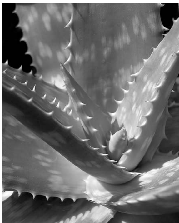
Figure 1. Aloe vera living plant.