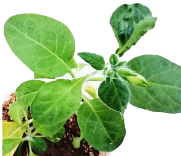
Figure 4 Severe mosaic symptoms were observed on Nicotiana rustica plants inoculated with ToBRFV and CMV, which appeared at 20 days post-inoculation (dpi).