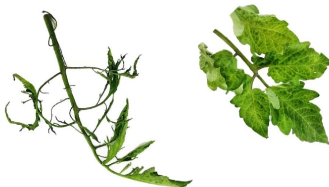
Figure 1. Natural and simultaneous infection of tomato plants by tomato brown rugose fruit virus (ToBRFV) and cucumber mosaic virus (CMV). Symptoms including of mosaic, shoestring, leaf deformation (Left), and blistering on leaves (Right).