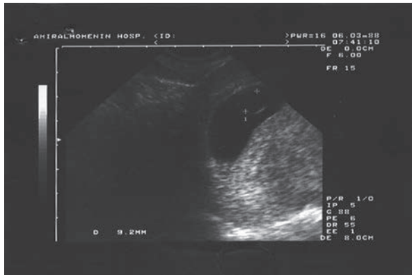
Fig 1: The largest yolk sac in a case with recurrent abortion.