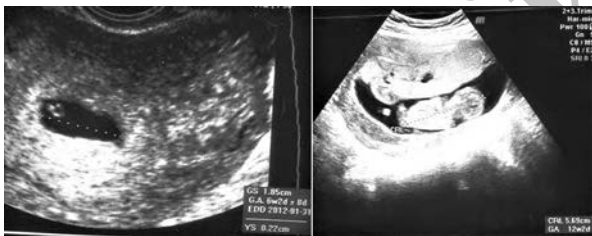
Fig 3: First trimester ultra-sound of partly molar change accompanying a normal fetus in family (S).

Ultrasound on her first trimester, illustrated a singleton pregnancy by an irregular gestational sac. In serial ultra-sound, the placenta has been larger with cystic area sounds like molar changes with large bilateral ovarian cysts, most probably theca lutein cysts (Fig 3). Amniocentesis of amniotic fluid in 17 weeks showed a normal XX female karyotype.