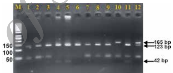
Fig.2: Agarose gel electrophoresis of polymerase chain reaction (PCR) assays for identification of the -238 (G/A) single nucleotide polymorphism (SNP).