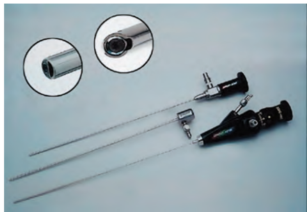
Fig.1: Two soft malleable fiberoptic microhysteroscopes with diameter of 2-mm used. The upper part is a telescope with operative channel of 0-degree and diameter of 2-mm. The lower part is a telescope with operative channel of 30-degree and diameter of 2-mm. The middle part includes the diagnostic sheath of the microhysteroscopic telescope.

Recanalization was performed during the early follicular phase of the menstrual cycle. The women were instructed to take one gram of azithromycin orally (Amoun, Egypt) before the procedure as an antibiotic prophylaxis, and 75 mg of diclofenac (Pharco, Egypt) was given intramuscularly on the day of recanalization, as an intra-operative analgesia. The women undergoing UGTR were placed in the lithotomy position with a partially full bladder in order to straighten the uterus. The cervix was exposed and the entire vagina was cleaned with betadine and draped. A Cook catheter (Cook South East Asia Pte Ltd., Singapore) was applied as in figure 1.