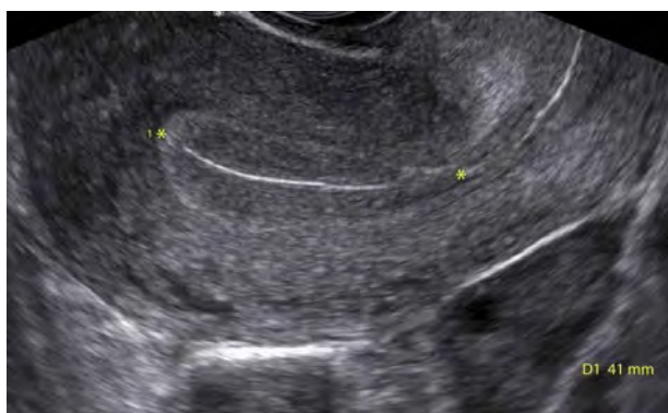
Fig. 1: Evaluation of endometrial length of uterus by vaginal ultrasound.

Assessment of follicle growth and endometrial condition were performed by vaginal ultrasound. If the patient had at least three follicles that were \geq 18 mm in two ovaries, we measured the endometrial length (from the internal ostium of the cervix to the fundus) of the uterus by TVS on the day of the human chorionic gonadotropin (hCG) administration (Fig. 1).