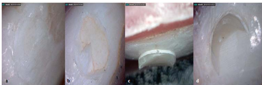
Figure 2: Types of fractures: a: Adhesive b: Mix c: Cohesive in the composite d: Cohesive in dentin

at 4°C ( p < 0.0001 ); however, there was no significant difference between the single bond at 25°C and 40°C and SE Bond at the three different temperature levels ( \alpha=0.05 ) (Figure 3).