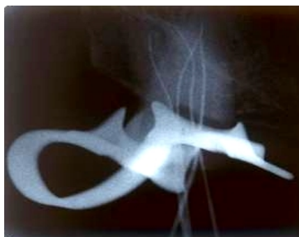
Figure 3: Working Length determination radiograph with four K-files.

An Apex locator (Root ZX; Morita, Tokyo, Japan) was used to estimate the working length of each canal. These lengths were confirmed by conventional intraoral periapical radiography. (Figure 3)