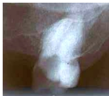
Figure 1: Initial radiograph of maxillary second molar

Examination showed that all teeth in the maxillary right posterior quadrant were extracted except the mentioned tooth. The patient did not indicate any history of trauma to the head region. Clinical and radiographic inspection of the maxillary right second molar revealed deep occlusal caries (Figure 1) with severe pain on probing by explorer.