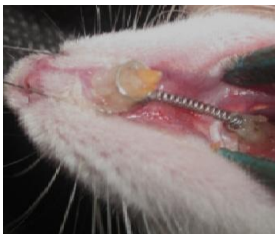
Figure 1: Experimental appliance. An active coiled spring exerted a force of approximately 60 g in the mesial direction

oyo, Japan) with an accuracy of 0.01 mm.